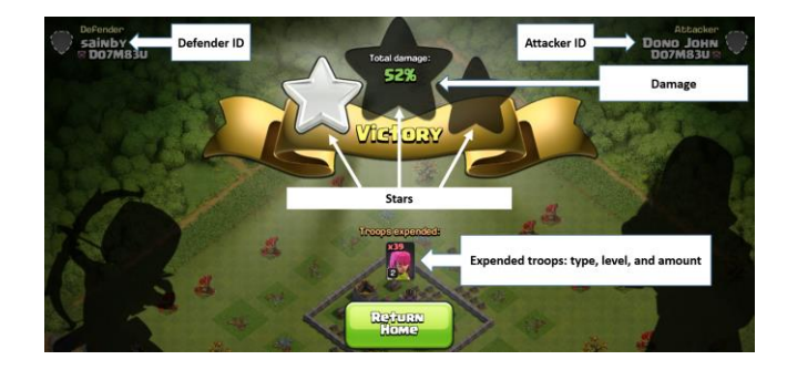
Fig. 1. CoC's attack result.

There are two main objectives to the game: 1) to defend the village using the sentry building and 2) to attack the other villages using the army. For this paper, the focus is only on the attack objective. At the end of each attack i.e. a maximum of three minutes, the game will display the result of the attack in 3-star rating and the percentage of the opponent's village being destroyed. Fig. 1 displays an example where 52% of the opponent's village were destroyed.