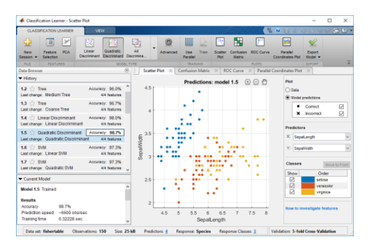
Fig. 4. MATLAB's example interface [25].

Using Andrew Ng's course as a reference for the purpose of discussion, his course consists of a number of lectures, practical sessions and coursework. The syllabus contains a number of mathematical concepts, machine learning descriptions, and application examples. The course itself involves the use of mathematically oriented software such as Octave [24] and MATLAB, where the interface (Fig. 4) can easily put-off many experienced data scientists, let alone second or third year university students.