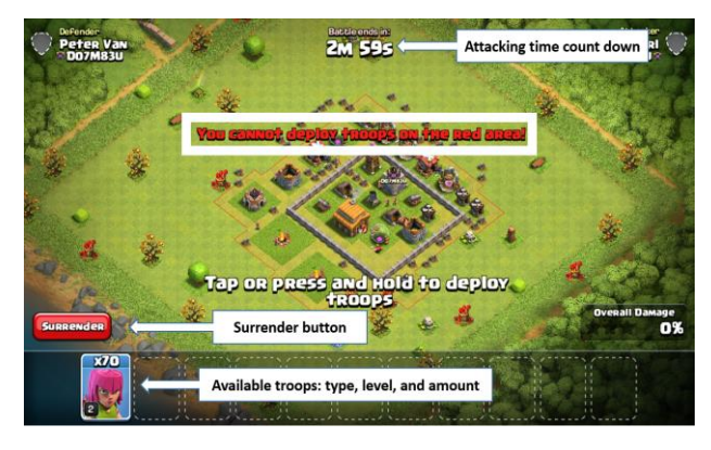
Fig. 3. CoC's attacking interface.

Fig. 3 illustrates an attack interface. Soldiers can only be deployed outside of the red highlighted area on the attacking interface. By selecting a type of soldier within an attacking army, the player can then tab on any other gaming area to place the soldier and begin the attack.