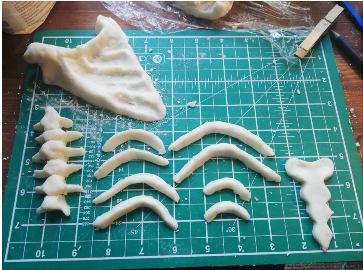
Image 6. Soula, N./Citizen Surgery Collective. (2020). Making BoneCracker .

Regarding the method of associating food with the body, our kitchen-grown victimless flesh imitates dishes which, through various techniques of cooking and baking, are constructed around a cavity of liquid such as poached eggs or a lava cake; the incision to the surface layer releases a more fluid substance, which we aim to remove by drainage. As a hybrid set of performative and screen-based bioart practices, our work draws not just from biomedical science but from art traditions with entirely different temporalities, such as oil painting. Like the body in pathology, the corpse, the edible simulator can be seen as a form of still life, the operation of which results in a "small murder"; the (projected) life is stilled, and the body has taken the character of a material object (Young, 1997). (Of course, in the context of eating animals, the still life of meat on the plate results from a big murder). The slowly progressing video and photographic "still lives" of our collective are being operatively and reversely "painted" with vegan ingredients through stages of deconstruction. However, some of our operations end with the body being put together through stitching or bone glue, for instance. This simulates the mechanics of an actual surgery. That is to say, instead of being merely dissected, the body under surgery is, in some ways, being manufactured by the sculptural practice of operations (Hirschauer, 1991).