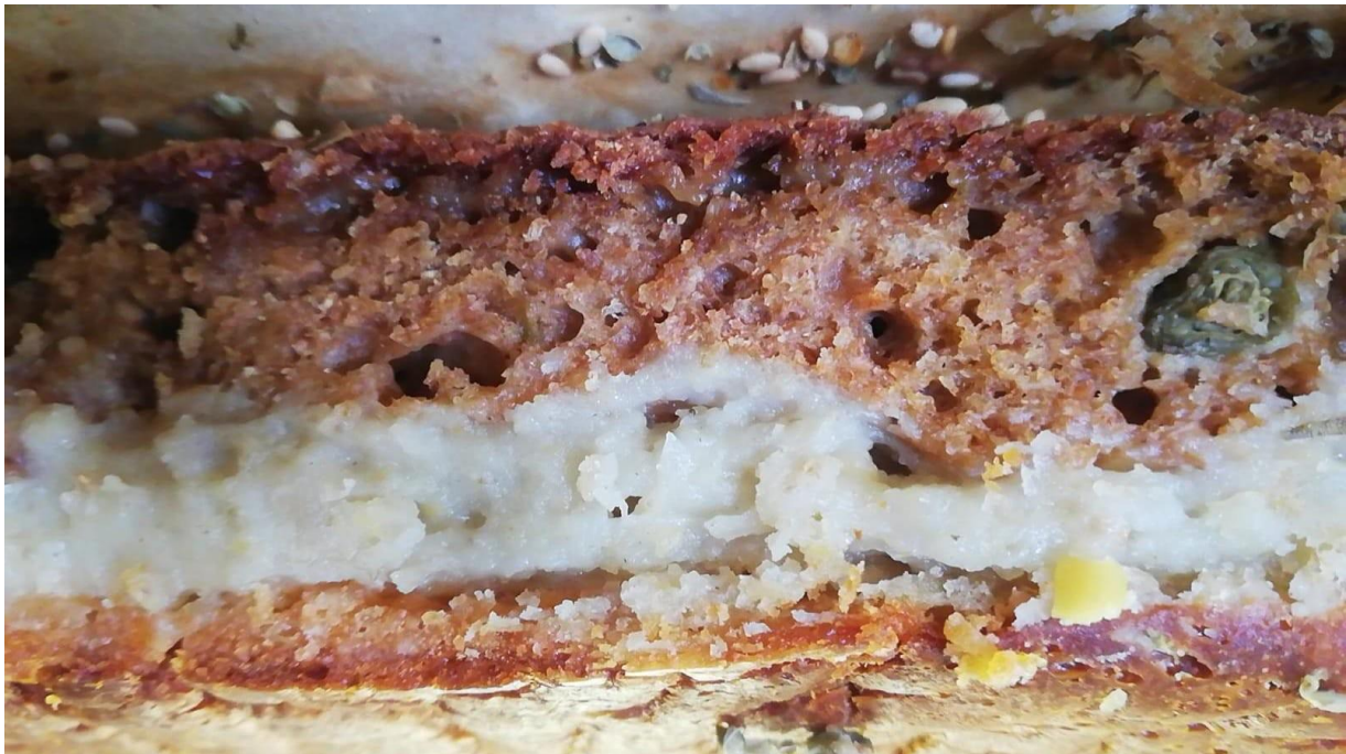
Image 5. Soula, N./Citizen Surgery Collective. (2021). DermaBread 2.0 .

human body. In fact, naming the simulator in a particular way is another avenue to poke the cultural uneasiness about seeing the human body as food. The name DermaBread purposefully merges two easily identifiable elements that do not belong together, the skin and bread. Moreover, in our participatory performances, the dialogue addresses the gastronomic language that disguises violence (even though it uses metaphors such as "skin of the milk"); we are altering the perception of food during tasting. Our participant responses reflect the power language has to change the sensory perception, such as the taste and mouthfeel of the ingredients: the eating experience is skewed by calling the white layer of the DermaBread 2.0 fat. However, language and voice are not the only ways our mouths produce meaning in the tutorials. We bring the sounds of chewing to the table, too, a potentially disgust-evoking experience for those with selective sound sensitivity syndrome, misophonia, triggered here by sounds of eating (Cavanna & Seri, 2015). In terms of sensory subtleties, however, speaking with food in the mouth communicates the simulator's moist level to a careful listener.