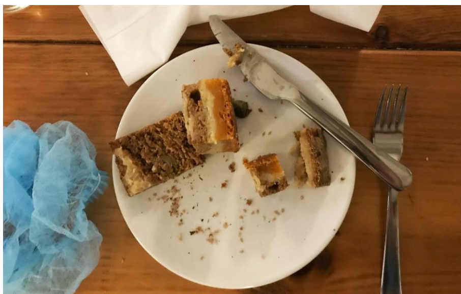
Image 3. Koski, K./Citizen Surgery Collective. (2021). DermaBread 2.0 Participant Plate .

While the experience of cognitive dissonance is one of our central strategies, contemplation is an important quality and method in our work as well. Next to the concentrated focus on surgical steps, in some of our performative workshops, we are incorporating contemplative exercises and ASMR-style techniques as a code of sensitization before the actual surgery assignments. The participants are guided to “awaken” their senses, slow down and tune into their bodies by various sensory triggers and haptic movement exercises as a step-by-step protocol narrated and demonstrated by the collective.