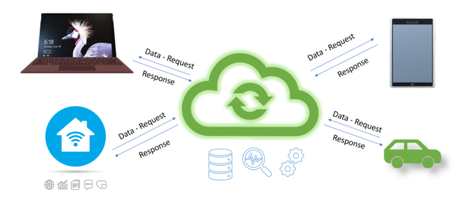
Fig. 1. Centralised Model embedding Data Analytics & Machine Learning

Data is used to train and test models in ML, a significant area of artificial intelligence, which can be deployed to take actions like humans. These trained models automate the processes and enhance the security of the network. Therefore, their use in cognitive IoT also has high significance [33]. The major focus of this study is on FL, which enables more efficient training and performance of models. FL allows mobile devices to work together to build a shared prediction model while still keeping all of the training data on the device since it separates the ability to apply ML from the obligation to store training data in the cloud. (View Fig. 1) Model training on the device goes much further than simply employing local models on mobile devices to produce predictions [2]. As a result, FL approach is cutting edge and ideal for IoT systems (View Fig. 2).