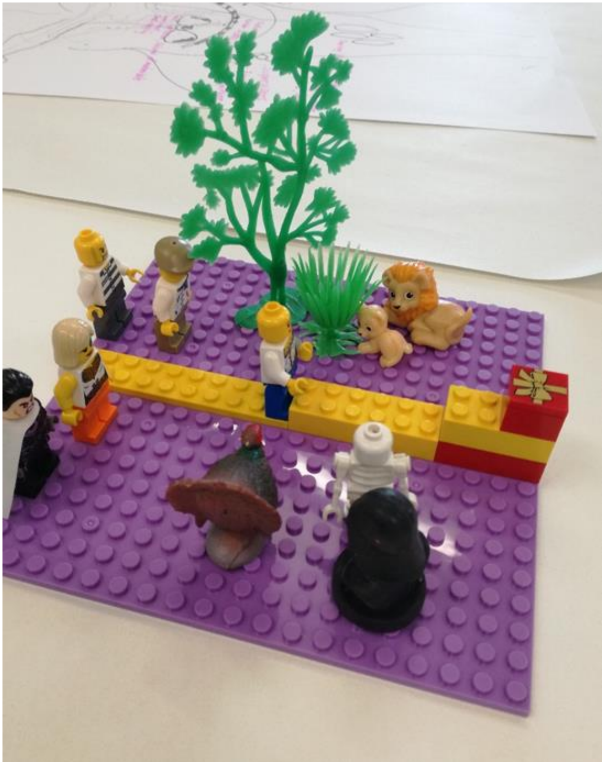
Figure 5 Phueng's Lego® Model of the Ph.D. Journey