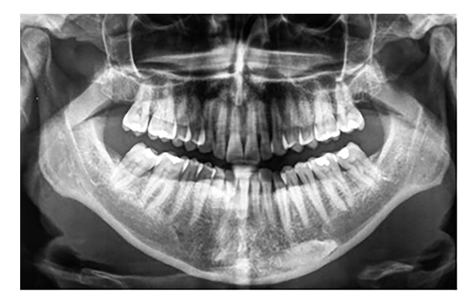
Figure 3. Patient with a Type 4 transmigrated right mandibular canine.

Besides these 25 patients with mandibular canine impaction, 4 of 1479 participants, three females and one male, were found to have mandibular canine transmigration. Considering the small size of the sample, no gender differences were observed. All patients had retained primary canines. In all four cases, the transmigrated canines were unilateral and impacted, with three involving the right side and one on the left side. Two canines were associated with dentigerous cysts. Of the four transmigrated mandibular canines in the present study, one was classified as type 1 and three were classified as type 4 according to Mupparapu's classification (Figure 3). The summary of these findings is shown in Table 3.