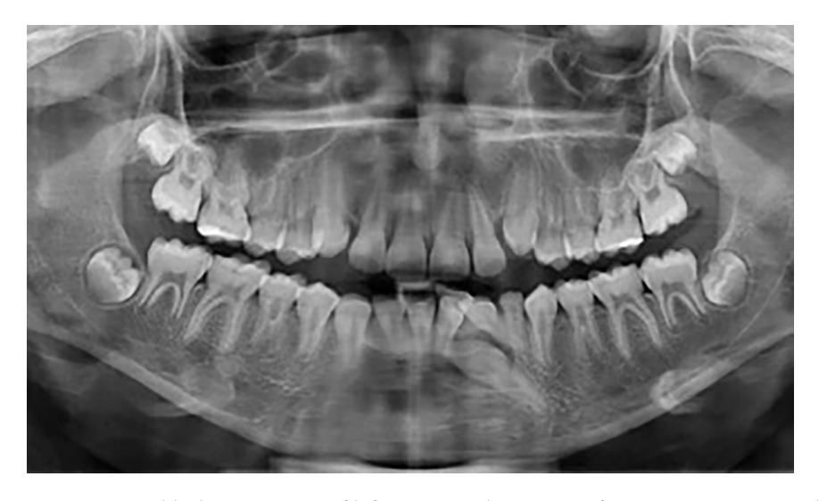
Figure 2. Mandibular impaction of left canine and presence of a supernumerary tooth.

16 patients (64%) had retained deciduous canines at the time of diagnosis. In three cases, the impacted canines were transposed in the lateral incisor region. In one of the patients, there was a supernumerary tooth in the lateral incisor region, and the primary canine was still present in the dental arch (Figure 2). In one patient in whom the primary canine and primary lateral incisor were retained, impaction of both the lower permanent canine and lower permanent lateral incisor was noted. One patient was found to have complete impaction of all four canines. None of the patients had traumatic episodes, and none of them had systemic disorders. All the patients were asymptomatic.