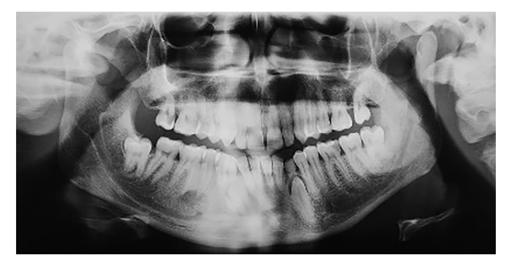
Figure 4. Patient with impaction of mandibular canines and retained deciduous canines.

In group B, a total of 13 patients were found to have mandibular canine impaction. Impaction of the canines was bilateral in 1 patient and unilateral in 12 patients, for a total of 14 impacted permanent mandibular canine teeth. Four patients still had retained deciduous canines at the time of diagnosis (Figure 4). In two cases, the impacted canines were transposed in the region of the lateral incisors. Besides these 13 patients with impacted mandibular canine transmigration. The transmigration was unilateral. In this patient, the primary canine was retained. None of the patients had traumatic episodes, and none of them had systemic disorders. All the patients were asymptomatic.