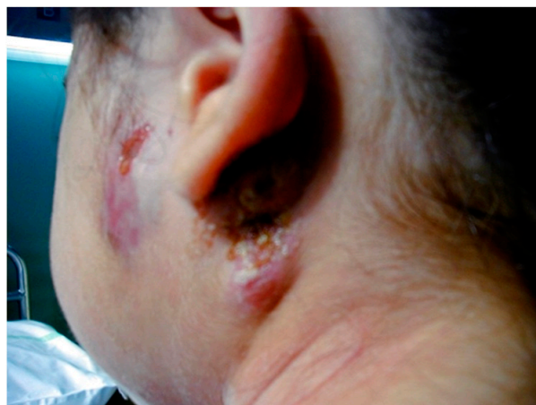
Figure 2. Scrofuloderma.