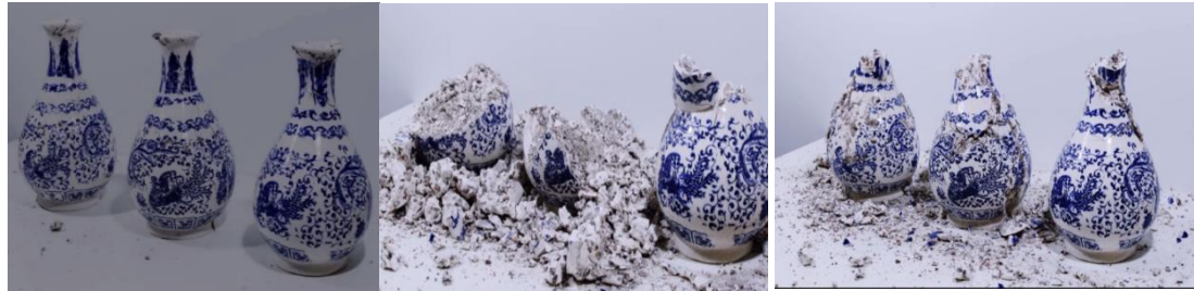
Figure 2. Screenshot from the Video of "The Great Compassion Mantra")