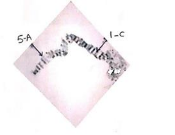
Figure 5: Salivary Polytene X-Chromosome map of South African (Zululand) Anopheles pharoensis (Miles et al., [17]) (Inversions are indicated by arrows at junctions 1-C and 5-A).