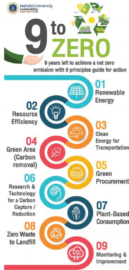
Figure 4. 9 to Zero Policy with 9 Principles Guide for Action.