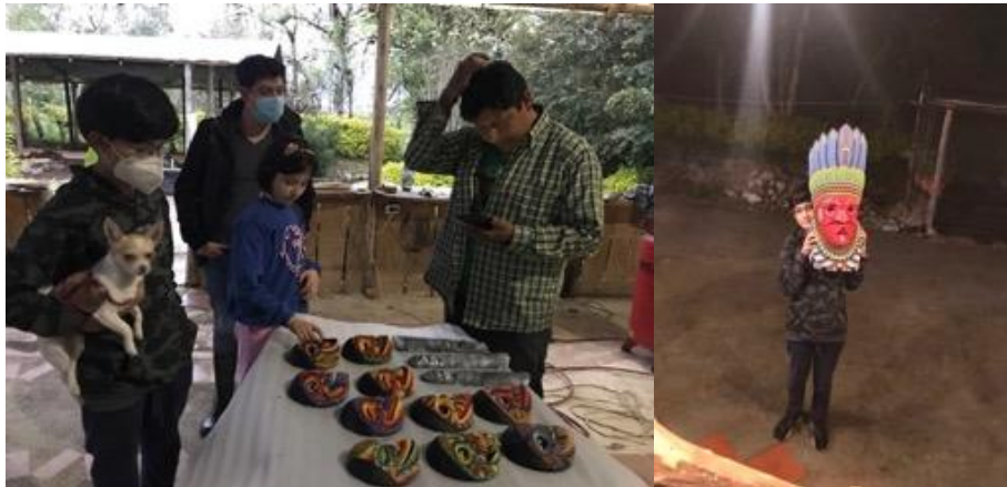
Rico, M. 2023. Ethnoeducation and Culture. Kamëntzä Culture. Sibundoy – Alto Putumayo- Colombia.

Culture and the environment are fundamental pillars in the new educational model, thus the configuration of the space called territory breaks the barriers and launches itself into a strong challenge of crossing borders, allowing new intercultural synergies with awareness of uses, resources and new technologies. With which it is counted, giving way to new world scenarios that resignify what inhabited and meant education in culture.