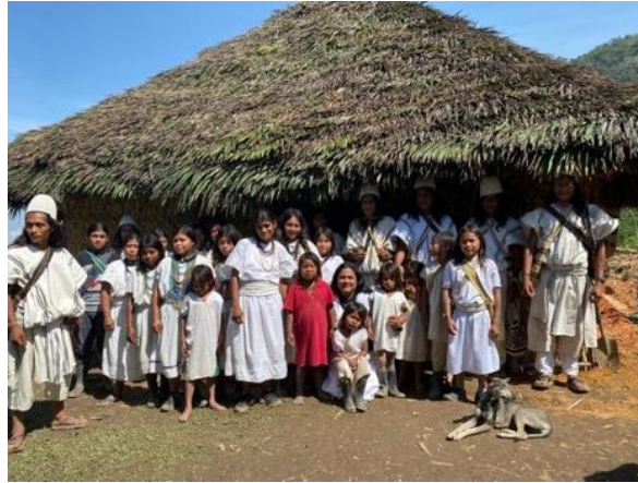
Iku culture, traditional school of the town of Kankawarwua. Sierra Nevada de Santa Marta. Colombia.

must begin with the formation of households, by families that have adequate sources of employment access and a chance for a dignified life where education has professional continuity as a source of employable, practical graduation to contribute with impact and relevance to the development of countries and the world. There is peace when a society is educated and education is placed at the service and strengthening of projects that contribute to human, scientific, technological and social development.