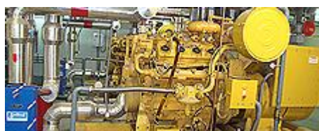
Figure 2. Co-generation plant

Commissioning and operation process of a high efficiency Tri-generation Plant, with a power of 462 kW in the Polytechnic Building of the University, through which it is intended, on the one hand, to reduce the cost of heating, cooling and hot water, as well as generate income for the Institution, all minimizing greenhouse gases.