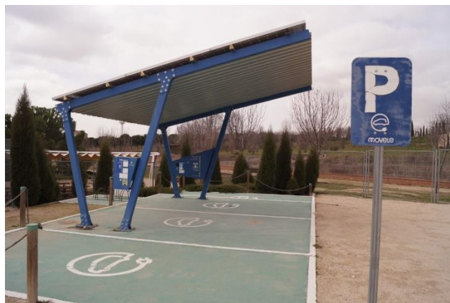
Figure 1. Real Jardín Botánico photovoltaic chargers

In the Real Jardín Botánico Juan Carlos I, located in the external Scientific-Technological Campus of the University, the first electric vehicle charging point that uses sunlight to produce electricity in Spain was installed.