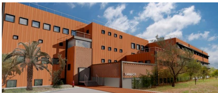
Figure 5. Improvement of energy efficiency in Pharmacy Building