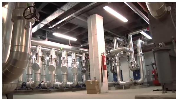
Figure 4. Geothermal plant

The University of Alcalá, within the framework of the Energy Plan of the Community of Madrid 2004 – 2012, proposed a project for the execution of an Energy Exchange System by means of a Geothermal Heat Pump that would serve the Air Conditioning System of the new Multipurpose and Modular Building, located in the External Scientific-Technological Campus. This geothermal exchange installation carried out for the air conditioning of the Building and DHW was carried out with funds from the subsidy granted by the Ministry of Economy and Finance of the Community of Madrid, within the aid program granted by the Madrid Institute of Development, for the promotion of energy saving and efficiency actions.