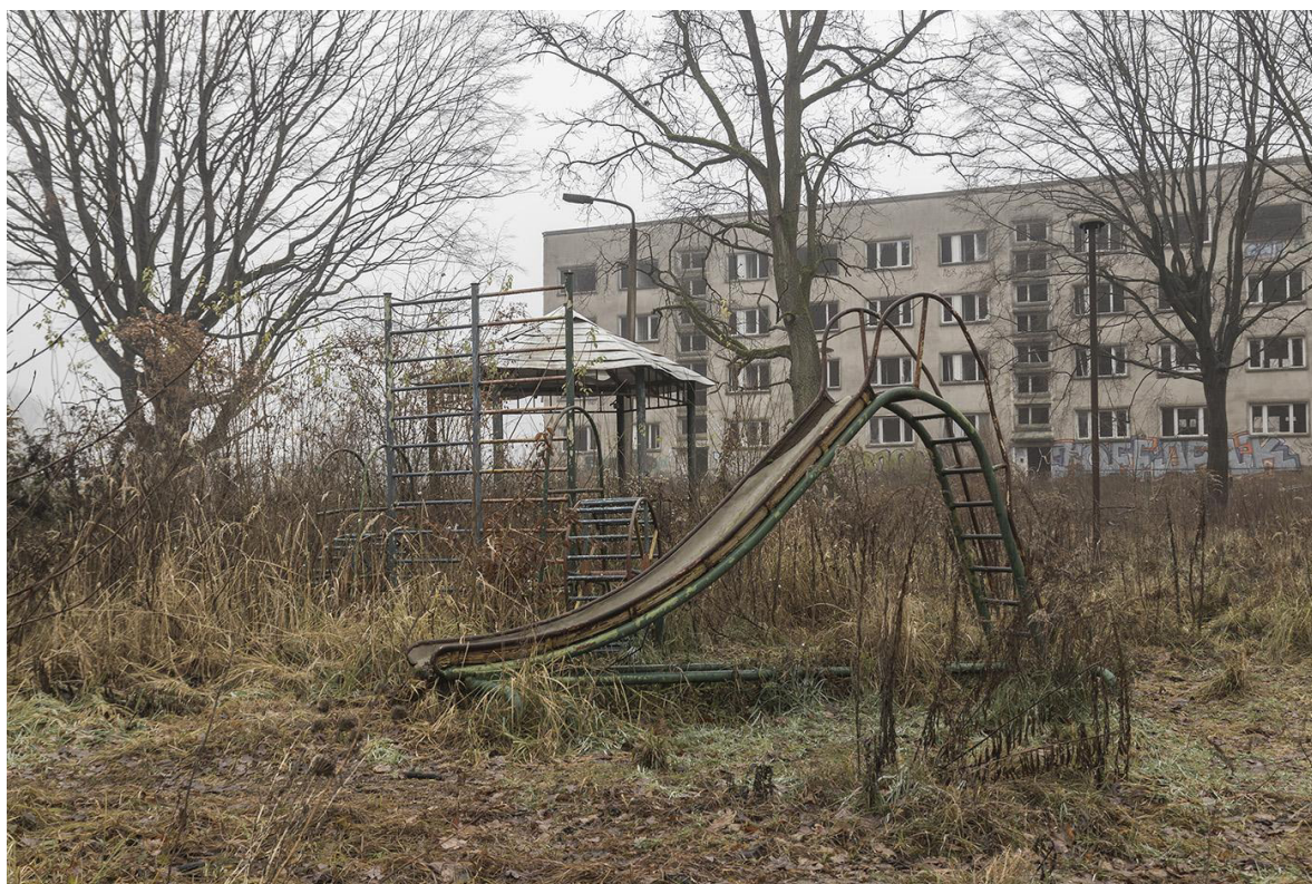
Fig. 2 Still frame from Rust, Mold, and Cracks , Lucas Rossi Gervilla, 2022.

It is essential to distinguish between modernity and modernisation because sometimes they might be treated as synonyms. They could occur together. However, they are not the