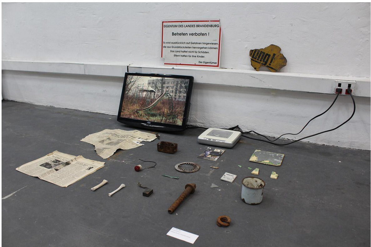
Fig. 4 Installation Rust, Mold, and Cracks , Érika Ozako, 2022.

All these experiences and perceptions can not be detached from the artistic process. The artwork is already being created amidst this background. Image production is just one part of it. It has an important role. Still, it can not be seen in an isolated manner. Artistic creation happens in the gaps. One of the first ones is the gap between what the artist has in mind and what is materialised by him or her. Another gap is between the object of art itself and the audience’s perception. It is not possible to foresee what happens amidst these