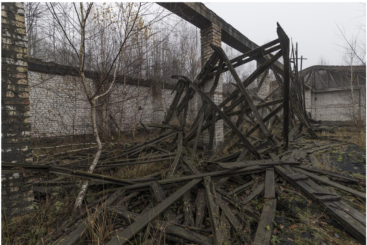
Fig. 3 Still frame from Rust, Mold, and Cracks , Lucas Rossi Gervilla, 2022.

It is still possible to attribute another role to the ruins and (no longer) abandoned places: when one considers them as a memory marker. Not only ruins that became notorious monuments worldwide but also the “ordinary” ones. Harvey (1991, p. 429) alerts us that “in a world of rapid flux and change,” spatial constructs could be seen “as fixed markers of human memory and of social values.” According to this idea, a ruin