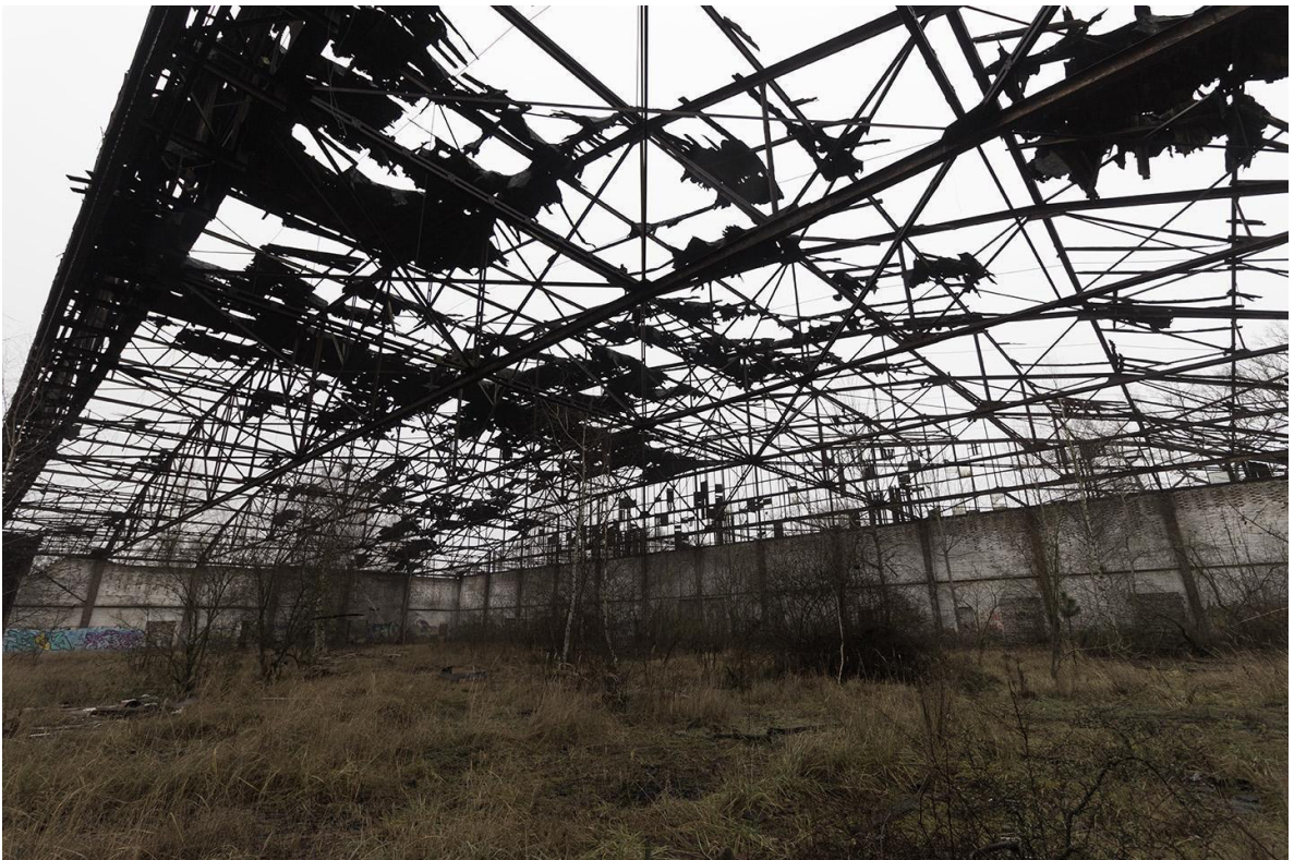
Fig. 1 Still frame from Rust, Mold, and Cracks , Lucas Rossi Gervilla, 2022.

Old Soviet Hangar at the Flugplatz Schönwalde (Airfield Schönwalde). The German National Socialist Government originally built the place in the 1930 decade. During WWII, the Soviet Red Army overtook the facilities and used them as a base for its ground troops and small aircraft until the German Reunification (1990). Over the decades, the same space