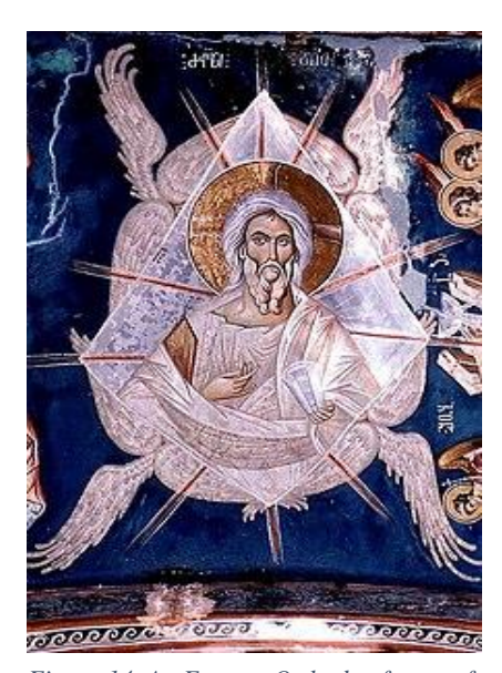
Figure 14. An Eastern Orthodox fresco of the Ancient of Days, fourteenth century.

equate Christ with the eternal God by presenting Him as a wise father-figure (Figure 14). Just as in images of the Lamb of God, Red and White factor equally into this image of Christ appearing at the Last Judgement, diminishing the worldly foibles of characters like Alisoun, Nicolas, and Absalon to mere trifles. While the sense of apocalyptic urgency is broached with a considerable amount of comedic levity in the Miller's Tale , Chaucer's medieval audience would have been entirely acquainted with the sincere need for salvation; it is indeed this conscious desire for repentance which leads them on their quest to Canterbury to begin with.