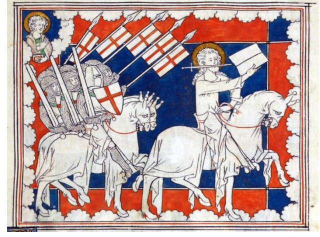
Figure 9. Christ leads a legion of Knights Templar into battle.

function as both a monastic and a military order gave it secular and religious superiority. This resentment boiled over into accusations of heresy against the Knights Templar, including While these accusations are seen by scholars today as rumors spread by other orders envious of the influence which