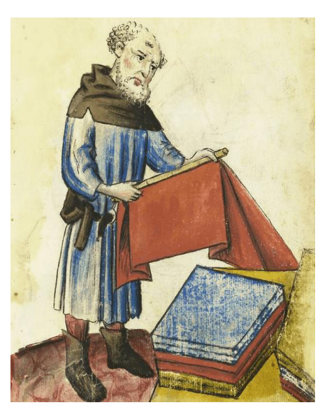
Figure 15. A medieval cloth merchant measures a sheath of red-dyed fabric.

attending to Husbandry,] and all other People that have not Forty Shillings of Goods, nor [of Chattels,] shall not take nor wear no Manner of Cloth, but Blanket, and Russet [Wool] of Twelve-Pence; and shall wear Girdles of Linen according to their Estate; and that in the manner that pertaineth to them, and not excessively. And it is ordained, that if any wear or do contrary to any of the Points aforesaid, that he shall forfeit the King all the Apparel that he hath so worn against the Form of this Ordinance. 104