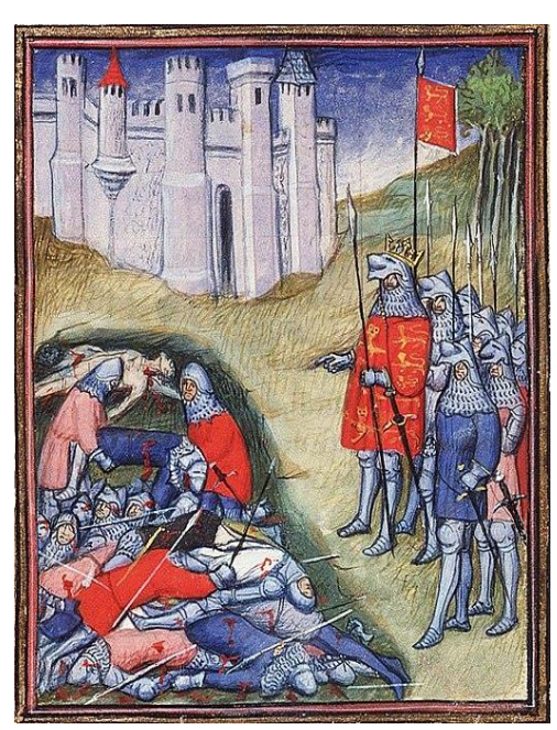
Figure 8. King Edward III surveys a mass grave of bloodied soldiers after the battle of Crecy in this painting from the early fifteenth century.

While Chaucer's familiarity with the traditions of Greek and Roman mythology as they survived in popular medieval culture is probable, it is certain that he was familiar with "wrath" of its own medieval type in the forms of everyday violence and momentous warfare. Chaucer's first "entry into public life" was in the form of military service in the royal army of King Edward III when he was just a teenager. The occasion was a part of what later came to be known as the Hundred Years War, begun by King Edward III asserting his claim to the