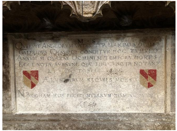
Figure 6. The inscription above Chaucer's tomb in Westminster Abbey, flanked by his argent and gules coat of arms

By his words in the Scrope-Grosvenor trial and his own heraldic symbolism, Chaucer admits to being attuned to the visual artistic presentations around him. Can it not then be said that these presentations, especially in terms of their color, influenced The Canterbury Tales , his most monumental work and cornerstone contribution to the English language? As a poetic colorist and employer of historic Red and White color pairing, Chaucer was rooted in knowledge equal parts abstract literary tradition and tangible "real-world" experience; he was indeed both a founder and a product of not just a literary, but also of a flourishing artistic historical age.