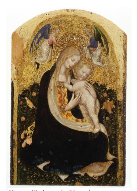
Figure 17. An early fifteenth-century Italian wood panel of the "Madonna of the Quail" in her rose garden.

of rose. A red rose against a pure white lily – the Prioress could, while feigning ignorance and humility, be subversively forwarding this comparison as a way of attesting to her knowledge of Red and White color pairing. The medieval rose was not necessarily a negative symbol, yet its connotation was ambiguous. It served at once as the embodiment of romantic love stemming from French courtly literature as well as a second flower to encompass the facets of Mary's experience with faith – Red roses stood for her sorrows, White for her joy, Gold for her glory. The symbol of the lily was the predominant flower in artistic contexts where the Virgin Mary