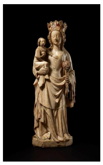
Figure 4. A mid-fourteenth century alabaster sculpture of the Virgin and Child with remnants of polychrome paint.

a more symbolic sense, white in other forms of visual culture was a manifestation of purity of the body and spirit. Alabaster, a white stone favored by medieval artists for working into religious sculpture to adorn places of worship (Figure 4), plays a significantly symbolic role in a gospel story of a woman, the penitent Mary Magdalene, who breaks open a vessel of pure alabaster and anoints the house with the fragrant oil within, equating the purity of the white stone to the regained purity of Mary (Matthew 26:7; Mark 14:3; Luke 7:37).