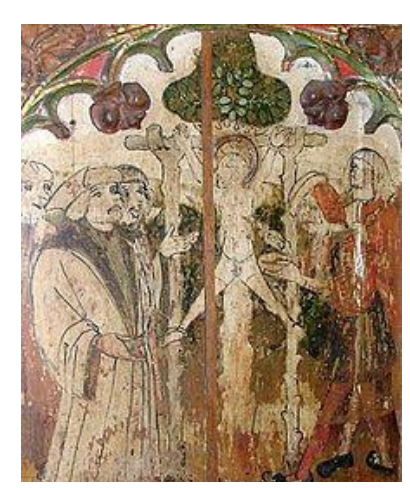
Figure 18. A rood screen depicts the crucifixion of the twelve-year-old William of Norwich.

Despite such isolated, yet earnest attempts at maintaining Jewish communities' innocence in the face of such hysteria, their harsh treatment in other sectors of society remained unfettered. Their prominence among the textile industries of Europe subjected them to suspicion and envy by foreign merchants, and it often ended up that the most "distinctly Jewish" profession was that of the dye industry, one already looked down on for the unsavory amount of toil required to produce the desired good and its