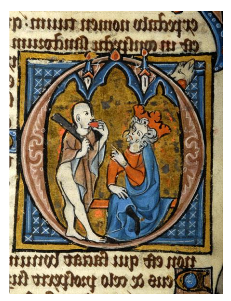
Figure 16. King David addresses a scantily dressed bald man in a decorated initial 'D.'

Historical events taking place outside of England, but not outside of Chaucer's sphere of duty, could have served as a model for the outrageous parading of garments present in the Reeve's Tale. Chaucer was sworn in as Controller of Wool Customs for the city of London in 1374, overseeing the import and export of raw and finished goods from overseas. Such business took him abroad to the city of Bruges in 1377 and to the region of Flanders in 1378, two low-country epicenters of wool manufacture. In the year