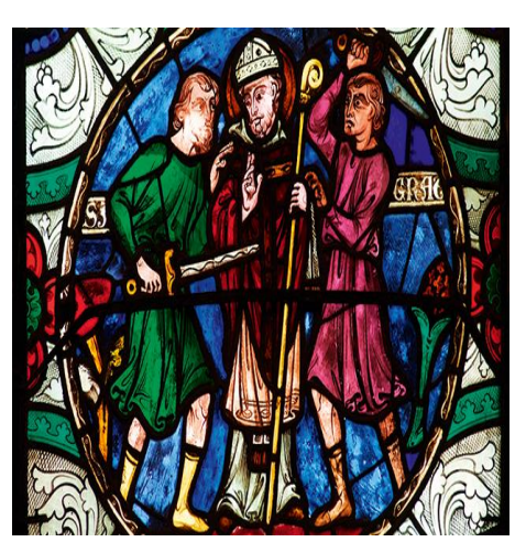
Figure 20. A stained-glass window at Canterbury Cathedral depicts the murder of Saint Thomas Becket, adorned with a red cloak, red halo, and red puncture wound on his palm to symbolize his martyrdom and unity with Christ.

Imagery of Thomas Becket concerning his martyrdom are thus "head-centered," where he typically is surrounded by a red halo symbolizing the blood of a martyr (Figure 20) and often accompanied by white swords with gold or red hilts either close to or directly piercing his head (Figure 21). The eminent fifth century monk and transplant to England, Benedict of Nursia, summarily described the importance of blood to the force behind Christian theology and practice in