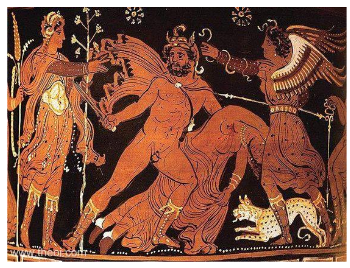
Figure 7. A red-figure vase painting (4^{th} century BC) of the wrathful Lycurgus being driven mad by the winged goddess Fury.

Knight's tale – a battle between two armies, organized by a fierce ruler and taking place in an arena constructed in the woods – but it similarly condemns the vice of bloodshed for personal satisfaction, a tenet of the sin of Wrath. Dio's disapproval of Julius Caesar could in this case be interpreted as a critique of his "wasting" of the gladiators' blood for