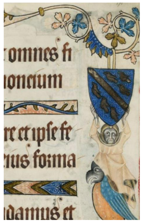
Figure 1. The coat of arms of Sir Geoffrey Luttrell are presented in the margins of Psalm 94 in Luttrell's personal psalter.

chivalry, the guiding social and religious code for those of upper-class medieval society. Clothing and dyed fabrics operated in a similar manner: those of the higher echelons had exclusive rights to certain colors and styles, and it was in their best interest to conspicuously display these at the expense of the lower classes forbidden from adorning themselves in such garb. Moreover, stained-glass windows were perhaps the most egalitarian of artforms in the medieval world; because Church attendance, veneration of saints and relics, and pilgrimage were essentially required for social functioning, the scenes depicted in the windows of western Europe's grand