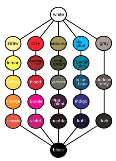
Figure 3. A modern reconstruction of al-Tusi's theory of color order.

Like ancient civilizations, medieval color theorists and color craftsmen (dyers) developed significance for colors determined by their prevalence in the natural world. Cultural and symbolic connotation were attributed to these, recorded, and then put on physical display through various modes of visual culture. In medieval culture especially, the color Red stood out as a hue of vital importance and diverse interpretation. Drawing again from ancient customs, medieval people viewed the color Red as a symbol of death due to its obvious relations with shed blood, and by extension warfare and