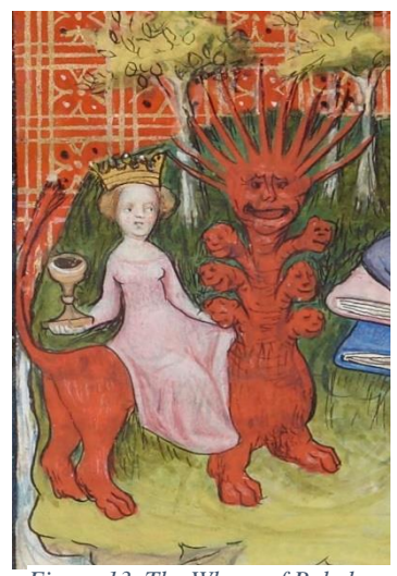
Figure 13. The Whore of Babylon rides atop the Dragon.

followers (17:6) and embodying the Christian stigmatization of sex outside of procreative and marital affairs (Figure 13). Another figure from Revelation exhibits both Red and White explicitly: "His head and his hairs were white like wool, as white as snow; and his eyes were as a flame of fire; and his feet like unto fine brass, as if they burned in a furnace, and his voice as the sound of many waters" (Revelation 1:14-15). He is the Ancient of Days, an image of Jesus Christ that is prefigured first in the book of Daniel: "I