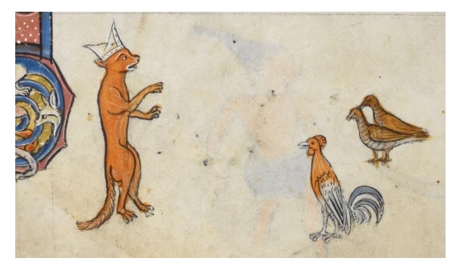
Figure 12. A red fox wears a miter and preaches to an audience of a red rooster and other birds in this marginal manuscript illumination.

they factored into the Christianized lens through which each animal was viewed. The Physiologus's assessment on the Nature and Significance of the Fox (Natura et Significacio wulpis)<sup>96</sup> details the commonly understood deceitfulness of foxes and their consequent