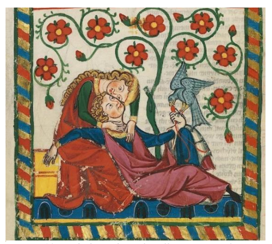
Figure 10. Red abounds in this illumination of two courtly lovers from the Codex Manesse, early fifteenth century.

The imagery attributed to Sir Thopas and the ensuing tale of his daring adventure into Fairyland ooze romantic elegance, and its and its diversity of metrical verse reminisces on the variation which other romantic poets of the time employed as an ostentatious show of rhetorical