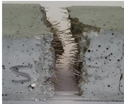
Fig. 3 Appearance of the concrete with steel microfibers at the failure point after testing the flexural strength