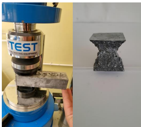
Fig. 4 Disposition during testing the compressive strength (left) and the appearance of the sample exposed to compression until failure (right)