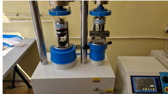
Fig. 2 Test setup for flexural strength testing

3 aims to show the uniform distribution of steel microfibers in the concrete mass and their proper orientation achieved during pouring in the moulds.