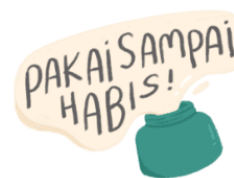
Figure 4. Campaign logo

The Logo indicator (X.4) gets a mean value of 4.17 in the Good category. It can be concluded that the #PakaiUntilHabis campaign logo is able to stick well in followers' memories.