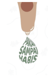
Figure 3. Sound and Music in the video.

The Sound and Music Indicator (X.3) received a mean score of 4.48 in the Very Good category. It can be concluded that the sound and music used in the video calling for the #UseUntilHabis campaign are able to attract the attention of followers in accepting and understanding the campaign.