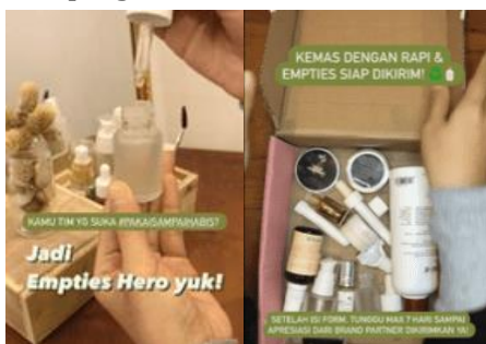
Figure 1. Photo of Beauty Products

The Photo Indicator (X.1) received a mean score of 4.45 in the Very Good category. It can be concluded that the inclusion of photos of beauty products used in photo uploads in the persuasive message of the #UseUntilHabis campaign is able to attract the attention of followers in accepting and understanding the campaign.