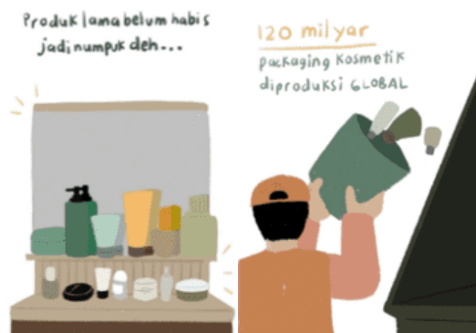
Figure 5. Illustration in the campaign video

#UseUntilHabis campaign are able to provide a good awareness effect for followers.