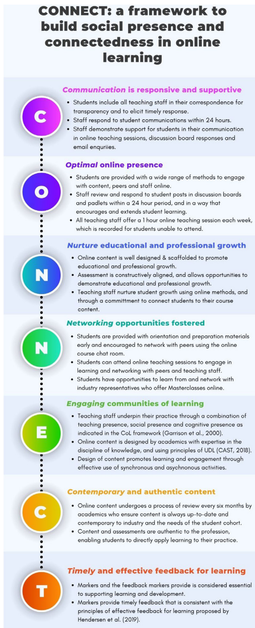
Fig. 3. CONNECT: a framework to build social presence and connectedness in online learning (Ahern (2023)).

interplay of well-designed resources, appropriately aligned assessments, and dedicated teaching support, this strategy creates an environment conducive to the development of learners' educational and professional capabilities.