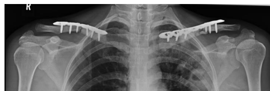
Figure 3: Post operative xray