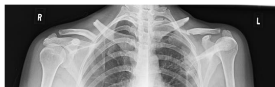
Figure 1: Patient preoperative xray

Isolated bilateral clavicle fracture is uncommon, and surgery is an option in cases of displaced fracture and persistent pain.