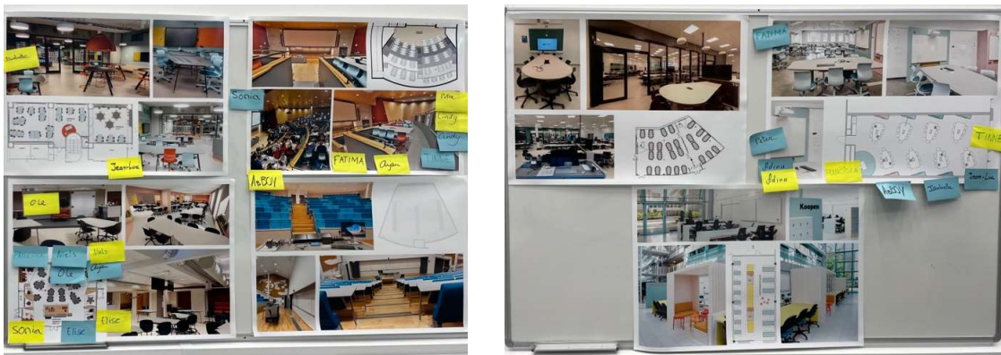
Fig. 1. The participants preferred Learning spaces as teachers (blue) and students (yellow).

In the workshop the participants were asked to choose the learning space they would prefer, both from a teacher's perspective and a student's perspective. The distribution of their choices is shown in Figure 1, where blue notes indicate the teacher perspective, and yellow notes indicate the student perspective.