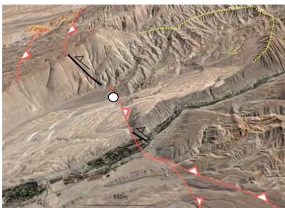
Figure 1: Google earth 3D image on the Calientes Fault system from South to North.

It's now established that Andean forearc is not concentrating as much tectonic shortening as the foreland since Middle Miocene. GPS measurements are neither available to inform on the long-term deformation across the Andes in Peru and anyway rather describe the elastic response of the Andean forearc to the Nasca-South American Plate convergence. Few neotectonic studies focuses on the Western side of the Andes and little is known about the active deformation in the Central Andes Pacific lowlands (Sébrier et al. , 1988). Recent publications mainly improved the description of geomorphic surfaces (Thouret et al. 2007) and cosmogenic dating of the latter show much younger ones than expected (Hall et al. , 2008). The topographic gradient on the western side of the Peruvian Andes is quite high as the trench (-7000m) lies only 200km away from the highest point (6000m). Moreover, authors still question the fact that the Andes build through a giant focused monocline or normal fault and demonstrate doing so the need of further mapping of the fault systems on the western side of the Central Andes (Schildgen et al. , 2007).