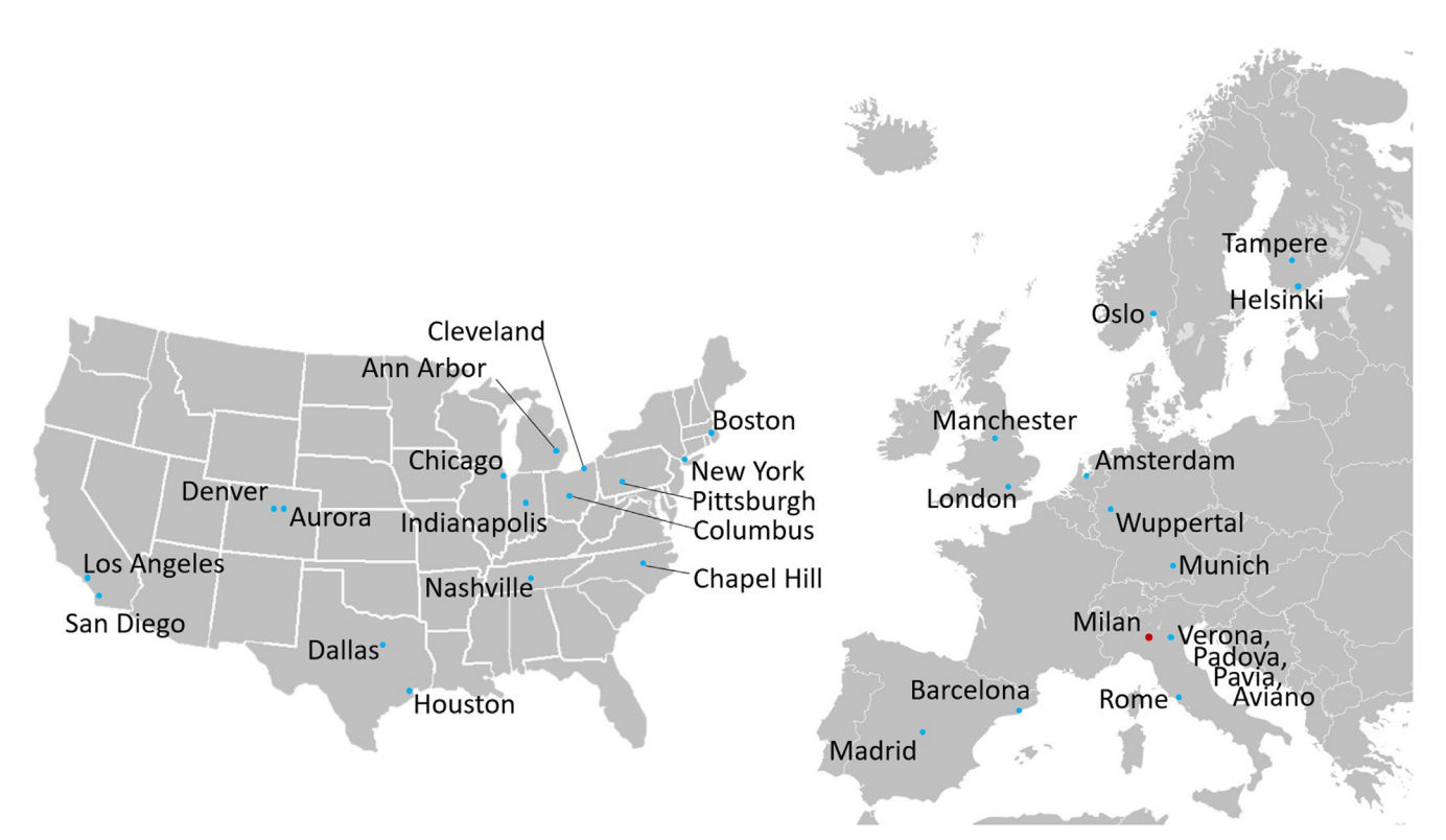
Supplementary Figure 2. Geographical distribution of participating centers. Red, site of the coordinating center. Blue, sites of the participating centers.