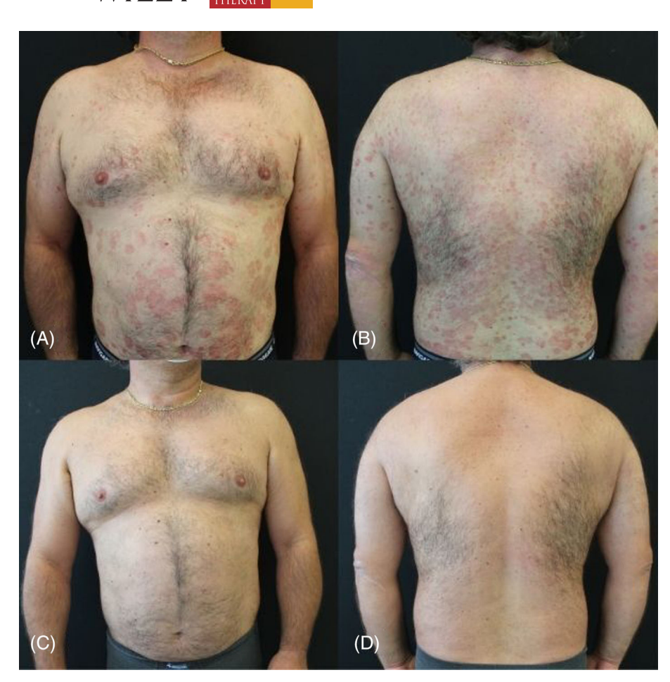
FIGURE 2 Clinical improvement of a tildrakizumab-treated patient from baseline (A and B) to week 28 (C and D)

time-points (mean PASI score decreasing from 14.19 \pm 8.11 at baseline to 1.76 \pm 2.82 at week 28) without reported safety issues. In our study population, PASI75 and PASI90 responses rates at week 28 (81.0% and 64.4%, respectively) are comparable to those reported in RCTs,<sup>3</sup> in which 80.4% of the patients in the reSURFACE 1 trial and 73.5% in the reSURFACE 2 trial reached a PASI75 response after 7 months of therapy. The proportion of patients achieving a PASI90 response at week 28 was found slightly higher in our study respect to data reported in reSURFACE-1 and -2 trials (64.4% vs. 51.6% and 55.6%, respectively), but the small sample size of our study compared to those of RCTs can be a possible explanation of this difference.