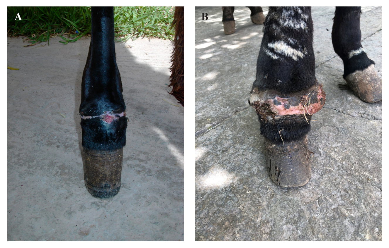
Figure 1. A) Circumferential wound on the right hind pastern with a draining tract and soft tissue swelling around and above the hobbling materiel (wire in this case); B) Extensive circumferential fibrosis with severe swelling (the hobbling materiel in this case was a bailing twine).