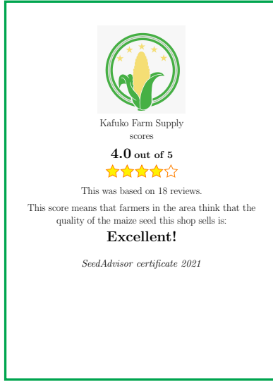
Figure 2: SeedAdvisor certificate

first agricultural season of 2022 (see Figure 1). Repeating the treatment was important to capture different dynamics of particular impact channels on certain outcomes. For instance, if seed quality is good but farmers hold pessimistic beliefs about the quality, disseminating information may already result in increased adoption and yield effects after a single season. However, if agro-dealers engage in counterfeiting, the threat of farmers switching to more honest agro-dealers may lead them to improve quality, which will only be reflected in subsequent ratings. This in turn could increase adoption but the effect of this on yields will only become apparent during harvest in the second season. Repetition may also be important for the effectiveness of certain impact pathways. For instance, agro-dealers may be more likely to change their behavior if they know that they will be scored again in the near future.