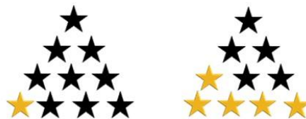
Figure 3: Level 1 and 5 icons in the Leaderboard

In the fourth badge experiment, we used the Badge Ladder tool to incorporate a leaderboard with 10 levels to promote achievement and friendly competition. Experience points associated with each level could be achieved by viewing various resources in the course. Default icons per level were changed to incorporate stars and colours (Figure 3) to provide visual feedback on the remaining stars needed to accomplish the top level and to encourage further participation. Additionally, badges were available for students acquiring first, second and third place on the leaderboard at the end of the semester.