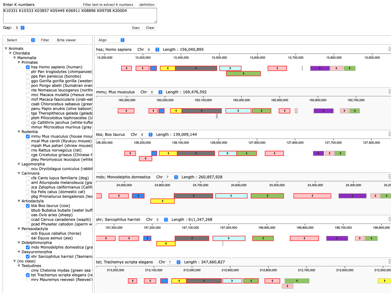
Figure 4. The KEGG genome browser is used to display syntenic regions in multiple genomes. Here, a region of eight genes represented as a sequence of eight K numbers is searched against all KEGG organisms. The result of matching organisms is shown in the taxonomy tree, from which selected genomes are displayed by aligning syntenic regions. Color coding is based on the functional category in KEGG.

The NETWORK database is a collection of network elements, each defined as a sequential (1D) connection of molecules in signaling and metabolic networks. Related network elements are organized in network variation maps, showing aligned sets of reference network elements and variant (perturbed) network elements caused by human gene variants, viruses and other pathogens and environmental factors. Drug–target relationships are also included in the variation map when human gene variants are involved as drug targets or markers. In the pathway map viewer, certain network elements are dynamically added to the pathway maps, such as in map00600, map00230 and map00220.