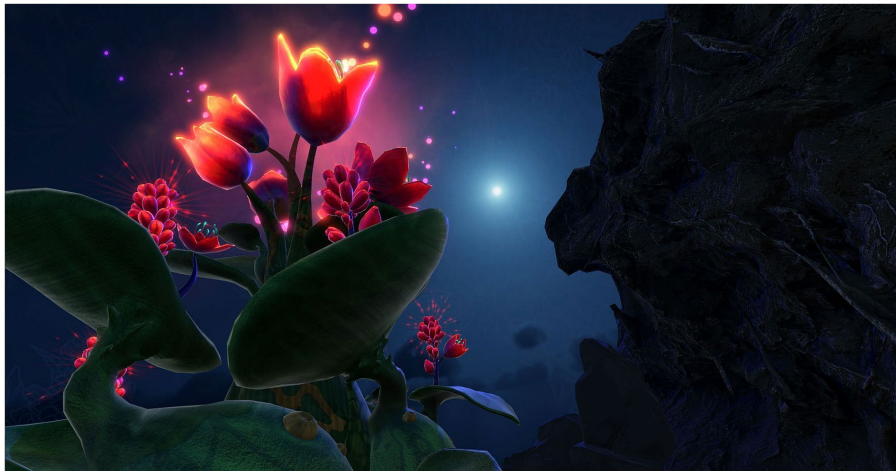
FIGURE 1 An image of the virtual environment during the virtual reality (VR) condition task.