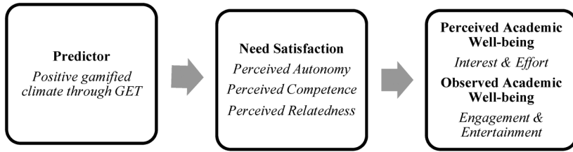
Figure 1. Mediation of psychological need satisfaction on perceived academic well-being and observed classroom behavior of academic well-being.