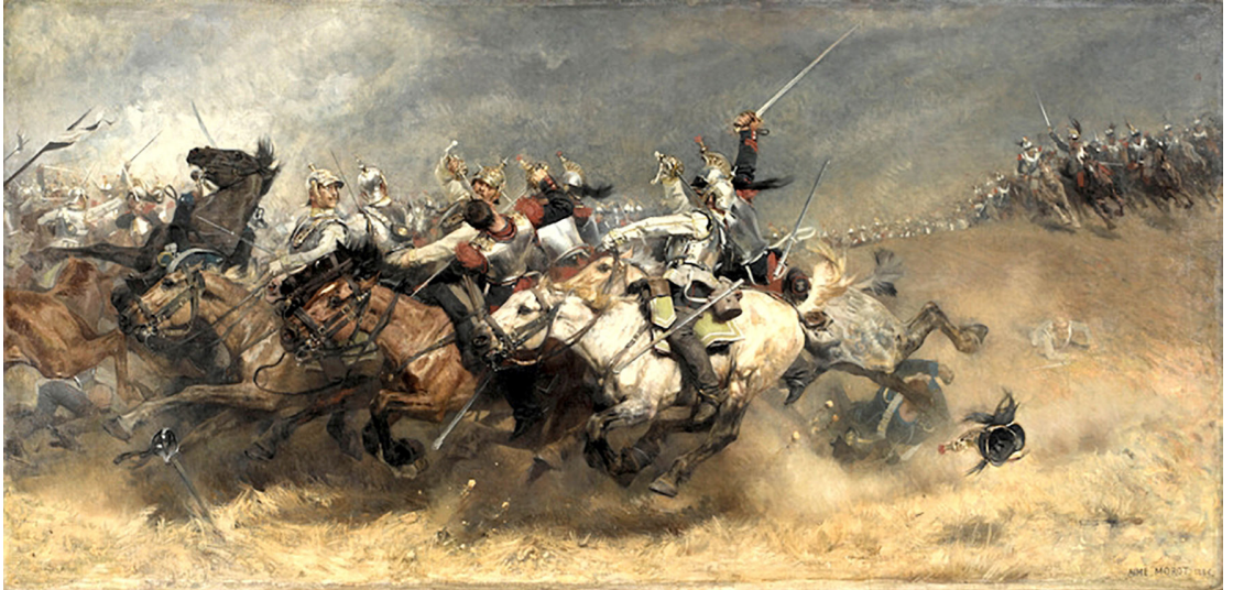
Aimé Morot, Rezonville, 16 August 1870, La Charge des Cuirassiers

repeatedly. Some of these actions resulted in heavy casualties, but they forced the Italian infantry to halt and deploy, thus achieving their tactical objective. With effective fields of fire limited by cover, the steadier riflemen had relied on traditional tactics: volleys from close order formations, or positions behind obstacles such as walls, at short range. In other instances, the infantry gave way. Early in the morning, a squadron of Austrian lancers caught Italian infantry in column; four out of five battalions fled. This was evidence to counter those who “would condemn large masses of cavalry to impotence,” and a reminder that “the indefinite improvements in firearms” had yet to eclipse the human dimension of the battlefield. A French officer wrote of the Austrian troopers’ achievement, “the moral effect, the shock, produced by their impetuous charge was such that the whole Corps was disorganised and paralysed for the rest of the day.” 59