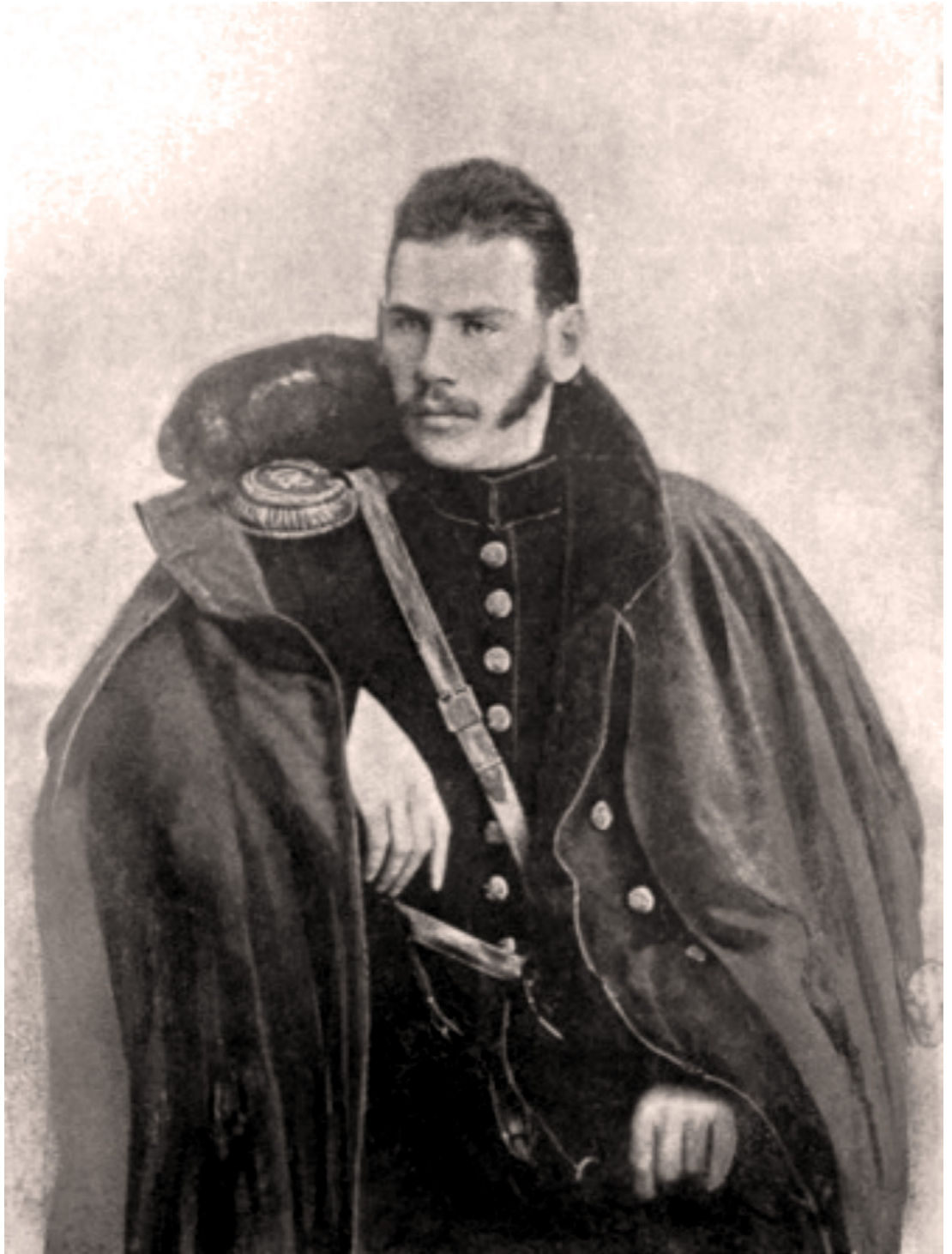
Lev Nikolaevič Tolstoj in uniforme di capitano d'artiglieria