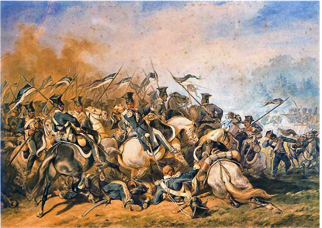
Juliusz Kossak: Polish lancers at the Battle of Ostrołęka, 1831

mon target at varying known ranges; at 450 yards (411m), 81 shots out of 100 had hit, 51 out of 100 at 700 yards (640m) and 31 out of 100 at 1000 yards (914m). He concluded that “a new era in warfare has commenced and the new firearm, with its ammunition, will make a complete change in the system of actual warfare.” Cavalry, Shaw noted, offered a particularly large target: a squadron was 200 feet (61m) long and nine feet (2.74m) high. This, in theory, would make them vulnerable as they manoeuvred on the battlefield even at extreme ranges. Shaw ventured to suggested that “half of the balls fired at cavalry at 1400 yards [1280m] would take effect.” The squadrons would be exposed to, at least, six minutes of such fire to cover 1100 yards (1006m) as they manoeuvred at the trot, before they even reached charging distance, 300 yards (274m) at the gallop. 6