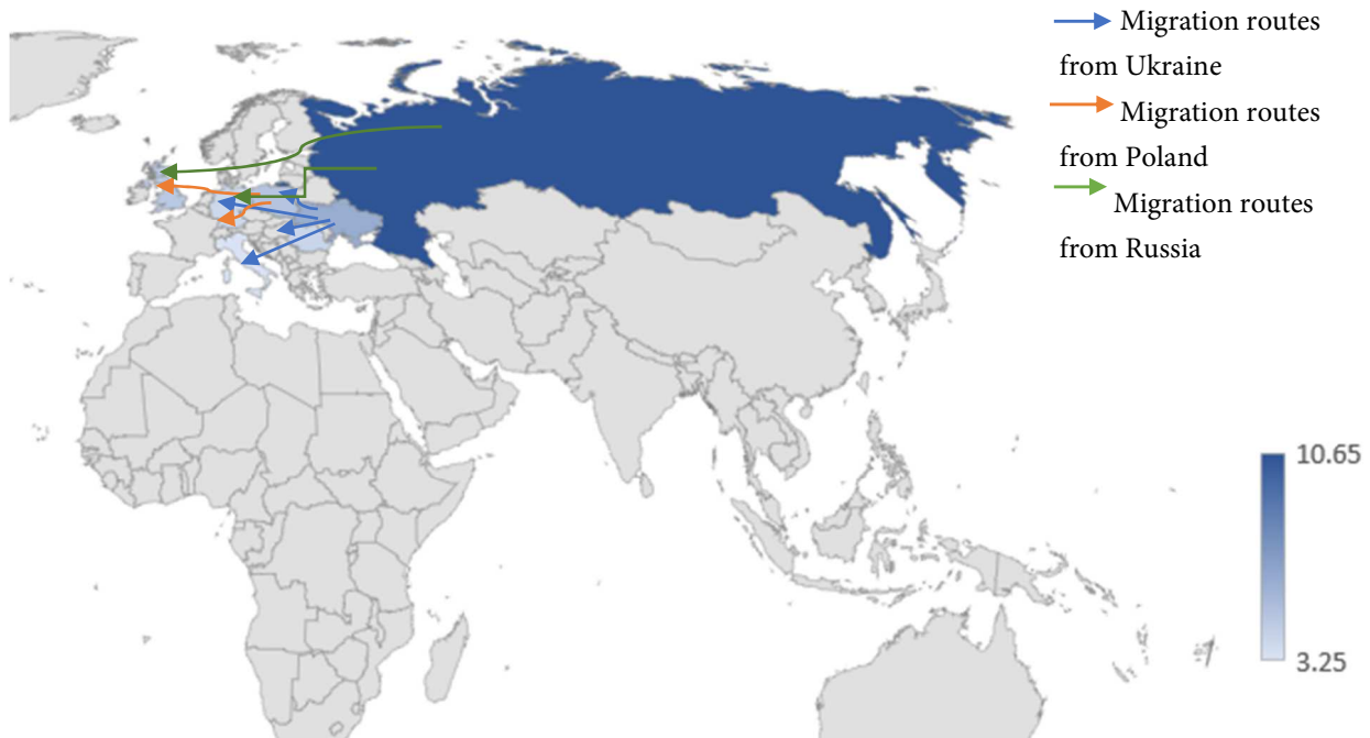
Figure 3. Major Migration Routes in Europe (Based on the Number of Migrants, in millions of people).