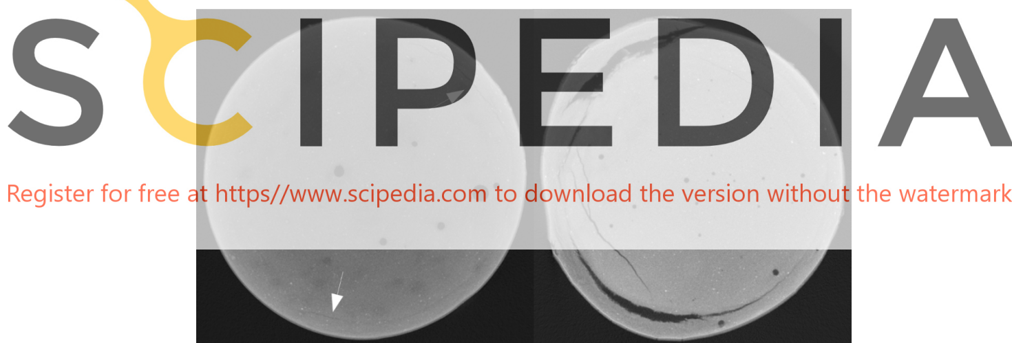
Figure 1. Cross sectional XmCT images of specimens exposed to magnesium sulfate solution for 3 months (left) and 4 months (right); white arrows indicate cracks formed due to sulfate attack.

In Figure 1, cross sectional XmCT slices of specimens exposed for 3 (left) and 4 (right) months to magnesium sulfate solution, are illustrated. The deterioration proceeded through the formation of concentric cracks, as indicated by the white arrows, resulting in expansion of the specimen and, eventually, detachment of the damaged part. As the process evolved, concentric cracks formed closer to the center of the cylinder, pointing to a layer-type deterioration.