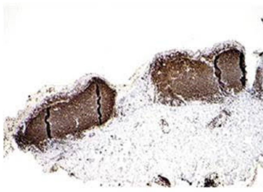
Figure 2. Section showing a reactive lymphoid follicle case stained immunohistochemically with a Bcell marker, CD20. This shows that the follicles are composed of B cells and have a non-destructive, well-defined architecture [27] (Courtesy Dr. S. Honavar, IJO editor-in-chief).

Follicles must be differentiated with papillary conjunctivitis. Papillary conjunctivitis causes include allergic/atopic (vernal, seasonal, or perennial), topical drugs or preparation (even cosmetics), and chronic irritation (mechanical i.e., contact lens), or ocular diseases (dry eyes, superior limbic conjunctivitis) that induce the polygonal distortion of the epithelium. Each elevation is usually polygonal, larger than a follicle, and contains vertically orientated vessels around which are many inflammatory cells. The nature of the inflammatory cells can suggest the etiology. For example, if mast cells and eosinophils are seen, it points to an allergic/atopic etiology [27,28]. They comprise a fibrovascular core with a variety of inflammatory cells, and the surface is often covered in metaplastic squamous epithelium.