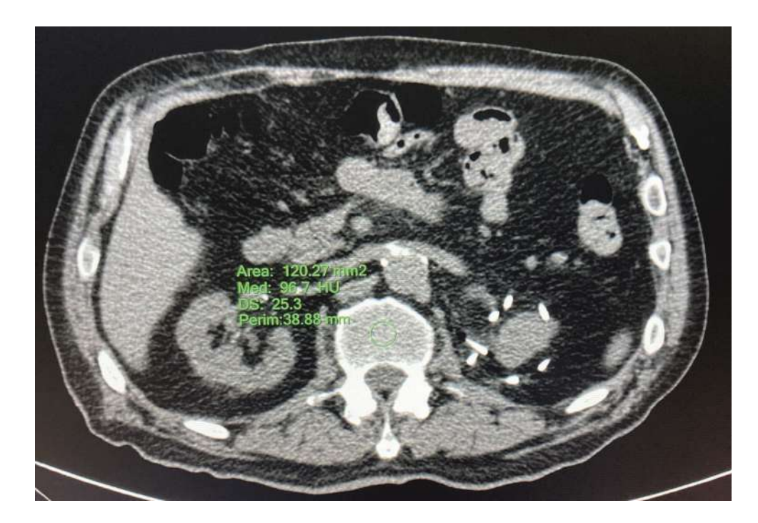
Figure 3. L1 bone mineral density.

The L1 vertebra is usually included in chest and abdominal CT scans, is easily identified and is useful for retrospective studies [25]. The L1 vertebral bone mineral density was measured using CT attenuation in HU by drawing a circle with a diameter of 1 cm in the center of the vertebral body of L1 [26] (Figure 3).