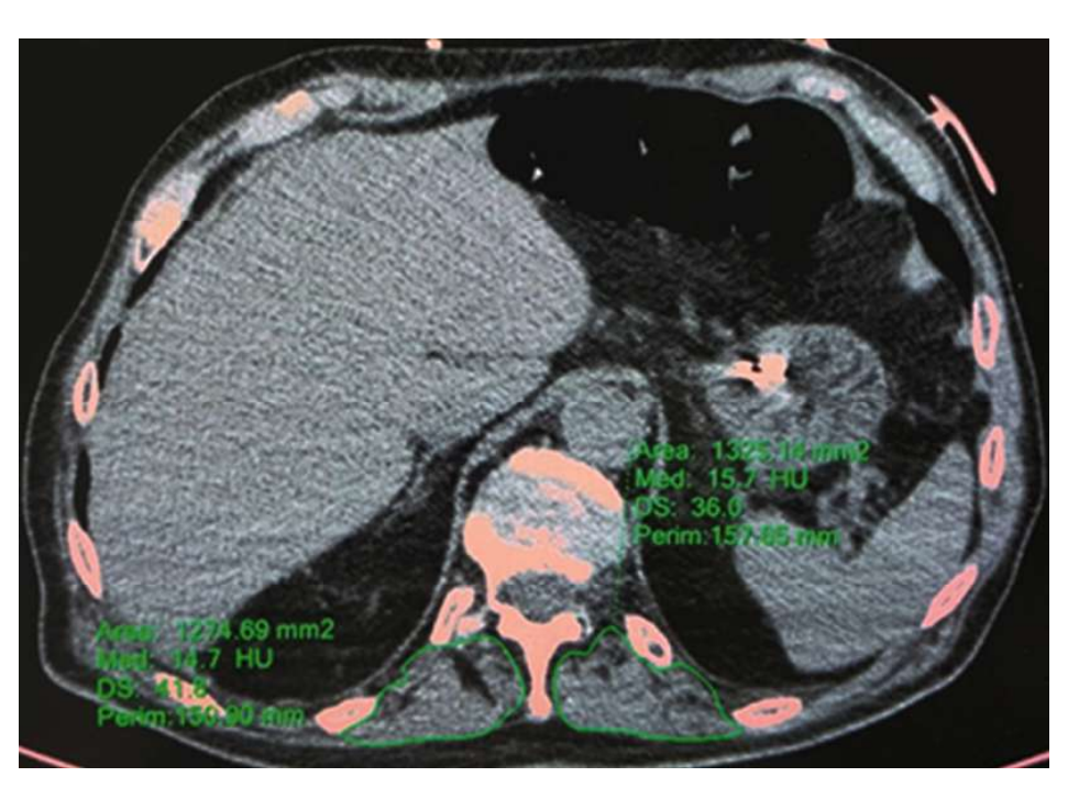
Figure 2. T12 paravertebral spinal muscle area and density.