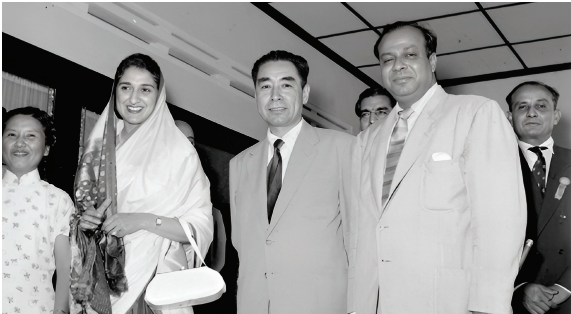
The "Five Principles of Peaceful Coexistence", first formulated by the then-Chinese Prime Minister Zhou Enlai and later adopted by the Non-Aligned Movement, express the aspirations of today's world. Zhou Enlai (middle) and Pakistani Prime Minister Muhammad Ali (right) and his wife (left) during the Bandung Conference.