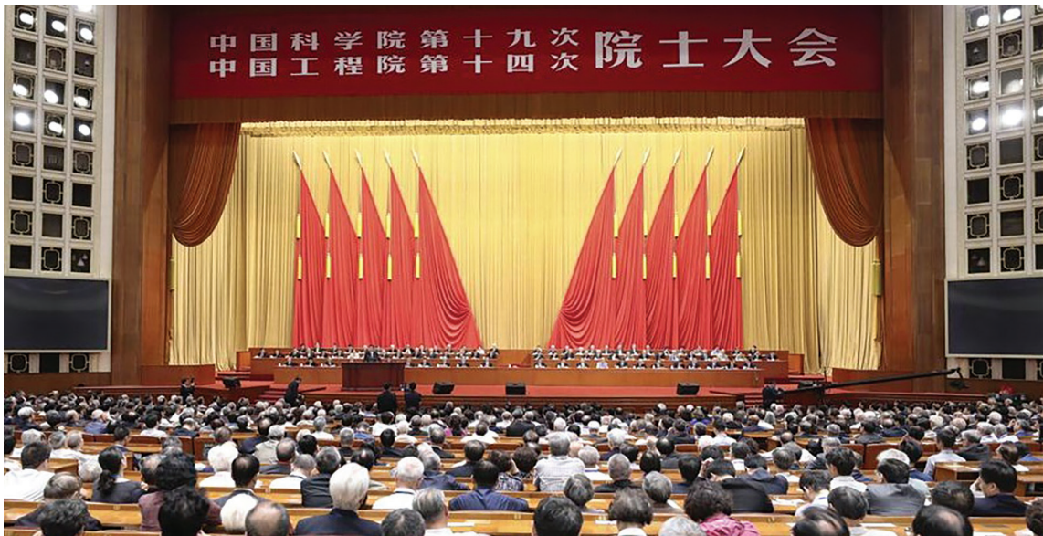
The 19th Meeting of the Chinese Academy of Sciences and the 14th Meeting of the Chinese Academy of Engineering were inaugurated on May 28, 2018 at the Great Hall of the People in Beijing, the capital of China.

China is creating new digital standards, due in part to cultural, social and language particularities but in larger part as a response to the US-instigated trade-tech war and a renewed push for self-reliance. China is also accelerating knowledge dissemination to its BRI partner countries via advanced telecommunications that have moved beyond simply globalising trade and knowledge. As such, global challenges are recognised in all corners of the world as the primary danger to humanity's very existence: