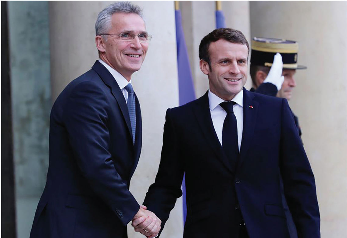
France's President Emmanuel Macron meets with visiting NATO General Secretary Jens Stoltenberg at Elysee Palace in Paris, France, Nov. 28, 2019.

the establishment of NATO can be seen as the beginning of an important paradigm shift in terms of questioning the alliance's future. However, it is not yet clear to what extent the US, which withdrew from many agreements in 2018, will be able to implement this idea.