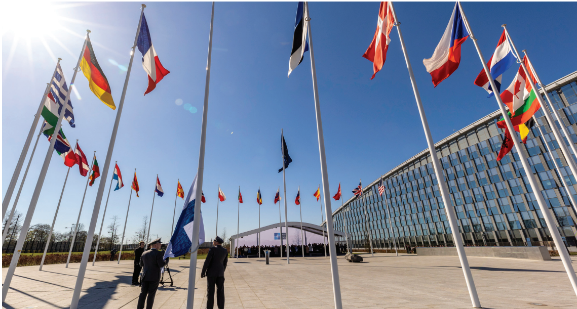
Finland accession ceremony to NATO, Brussels, Belgium.