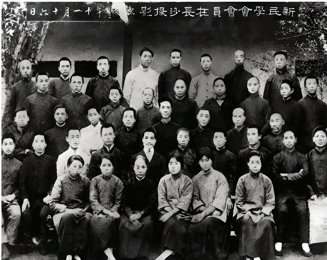
In the winter of 1917, the leaders of CCP, Mao Zedong and Cai Hesen, initiated the organization, New Society Study Society (Xinmin Xuehui). In the picture, Mao Zedong is fourth from the left in the back row, Cai Hesen is the first from the right in the back row. Changsha, November 26, 1919.

He emerged as a youth leader during his years at the First Normal School 4 . During this period, the two very close friends, Cai and Mao, formed an intellectual model that reflected their later political personalities. While Mao took a heroic path to serve China, which was more inclined to follow the path of the “Great Men”, Cai emphasized the education of the masses and the strengthening of their rights and freedoms. There was also a philosophical difference between the two. While Mao valued Confucius and Mencius,