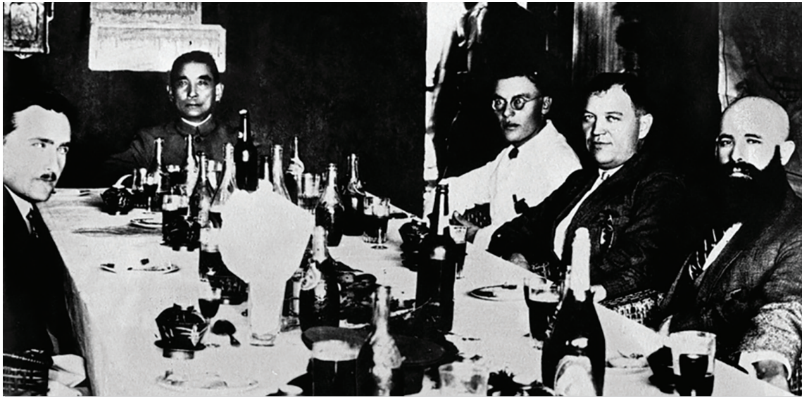
From the meeting of Sun Yat Sen (second from the left), Soviet Union's military advisor in China, Vasily Blyukher (first from the left, stayed in China from 1924 to 1927), and other Soviet advisors. (1924)

In his article titled “We Wish Victory to the Turkish Nationalist Party” 11 (Hesen, 1978: 81-85) in September 1922, he briefly summarized Türkiye’s process from the First World War to the War of Independence and stated that Türkiye’s victory was a hope for all oppressed nations. In his article, Cai also emphasized the similarity between the Guomindang and those led by Mustafa Kemal. In his article, he says: “How similar are the Chinese Nationalist Party (Guomindang) and the Turkish Nationalist Party, which have been fighting the imperialists in the Far East for the last 30 years, and how important this scene is for the oppressed nations! Look, our 400 million brothers, the oppressed Turks won a great victory against the imperialists! Their nationalist parties set them on the road to victory! While we envy them, we should also learn from them. Call on our party (Guomindang) to cooperate with Soviet