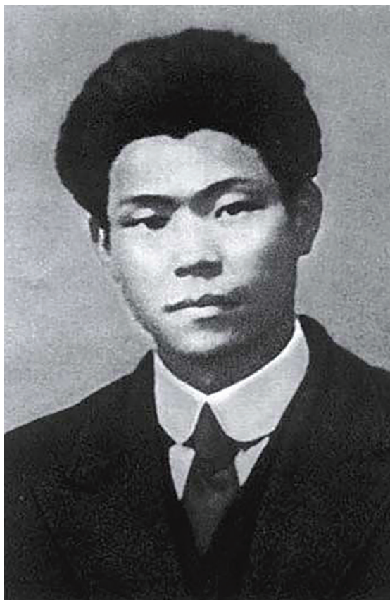
Cai Hesen