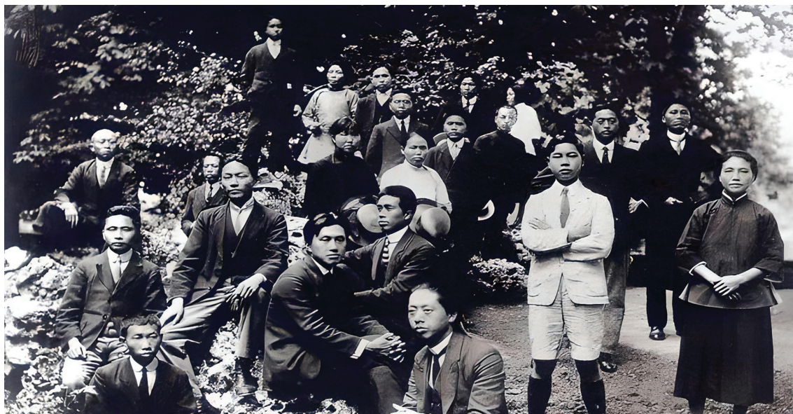
In July 1920, Cai Hesen, along with Xiang Junyu and other members of the Xinmin Society who remained in France, took a group photograph.

On July 23-31, 1921, with the participation of 12 delegates representing different parts of the country (Mao Zedong, Dong Biwu, Chen Tanqiu, He Shuheng, Wang Jinmei, Deng Enming, Li Da, Liu Renjing, Chen Gongbo, Li Hanjun, Zhanng Guotao and Zhou Fohai), the first CPC National Congress was held in Shanghai. On July 31, 1921, the CPC was officially established.