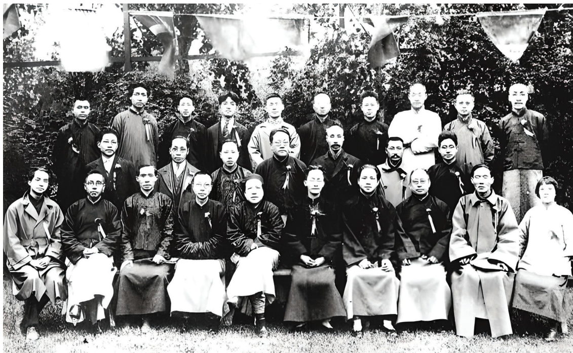
A photograph of the gathering on the third anniversary of the appointment of representatives of the Guomindang and CCP, with Sun Yat Sen as the President of the Revolutionary Government in Guangzhou, on May 5, 1924.

The event took place at Sun Yat Sen's residence in Shanghai.