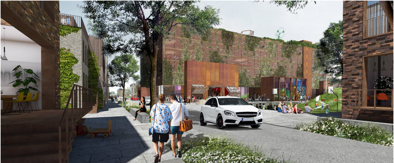
Figure 5. Neighborhood square with mobility hub: Visualization for Oberbillwerder.

a concordance of interests between design and mobility demands.