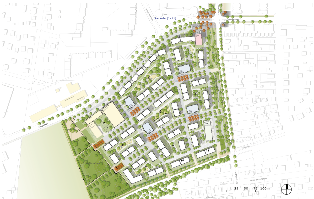
8 Entwicklungsteifaden Buckower Felder