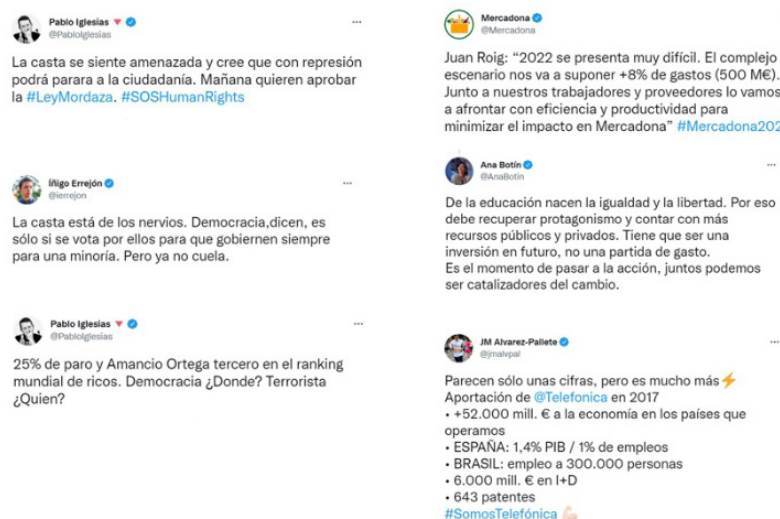
Figure 1. Examples of the Twitter stimuli used in the implicit association test (IAT).

The research focused on the study of public conversation on the social network Twitter. The most representative terms from previous research (caste, homeland, rich) were used to search the messages of the extreme-left politicians. For the messages of the elite classes, we searched for the messages of corporate events that had the most interaction. The FreeIAT program was used for the design and, to carry out the measurement, each subject was placed in front of a laptop computer. The stimuli were: six photographs of Twitter messages by people from the elite classes, six photographs of Twitter messages by politicians of the extreme left (see Figure 1), seven words related to honesty, and seven