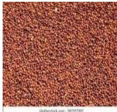
Figure 3: Finger millet (Rapoko) grains