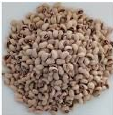
Figure 2: Cowpea grains

Finger millet was cleaned, and malting carried out according to a method detailed by [29]. Finger millet grains (2kg) were washed and steeped in a 2-litre water container for a period of 24 hours. Water was changed after every 6 h during steeping. The finger millet grains were then washed and germinated in ventilated cupboards for 2 days at an ambient temperature of 28 °C with regular sprinkling of water. The malted finger millet grains were removed and dried in an oven at 48 \pm 2 °C for 24 hours. The grains were milled using an experimental mill fitted with a 500 µm opening screen to give whole grain flour and stored at 9-10 °C until further analysis. Cowpeas grains (Fig 2) were also screened, cleaned, and milled into flour. Cowpeas were hydrated, germinated, and fermented to increase nutrition quality and reduce antinutritional factors. Cowpeas were soaked for 8 hrs, germinated for about 52 hours at 25°C and fermented for 24 hours at 30°C. However, this did not affect its proximate composition of both finger millet and cowpeas.