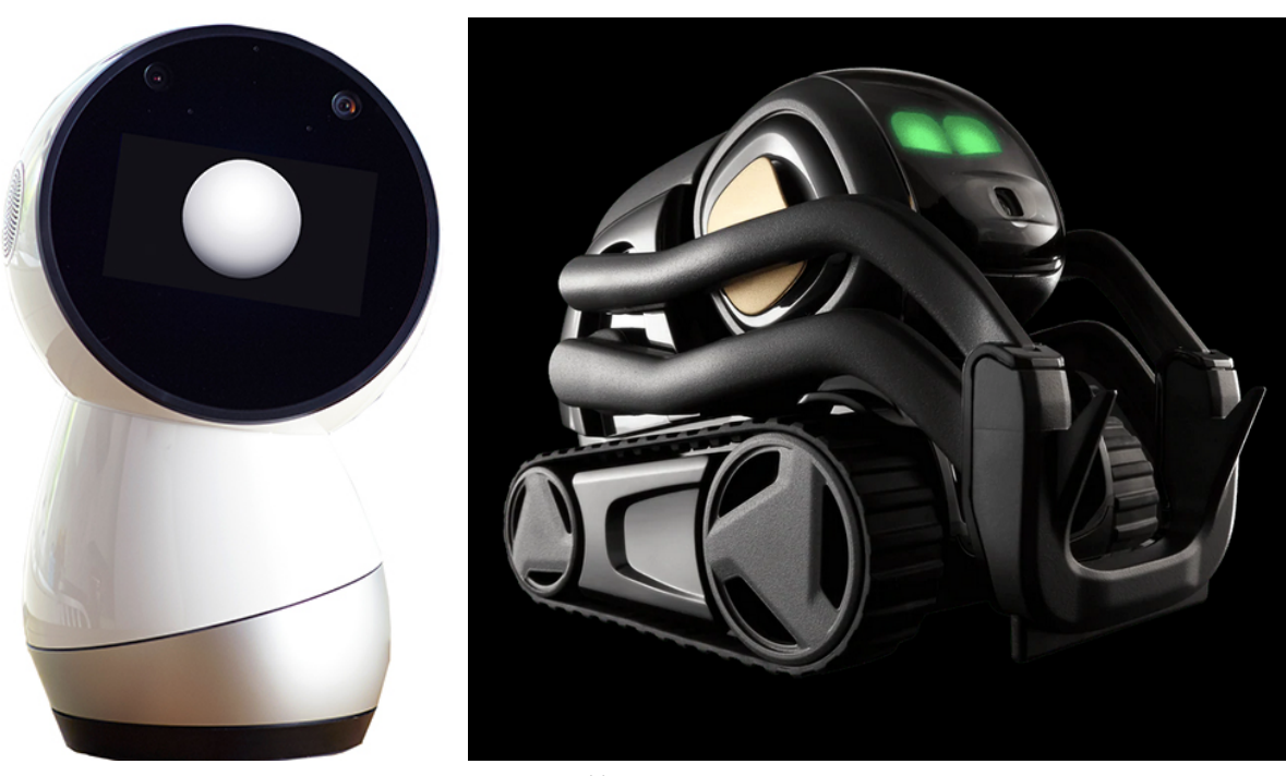
Figure 2: Jibo ( left ) (IEEE Robots)<sup>117</sup> and Vector 2.0. ( right ) (Digital Dream Labs).<sup>118</sup>