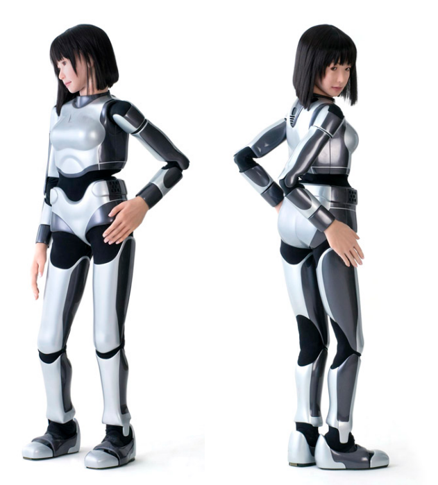
Figure 9: HRP-4C or Miim (IEEE Robots). 127