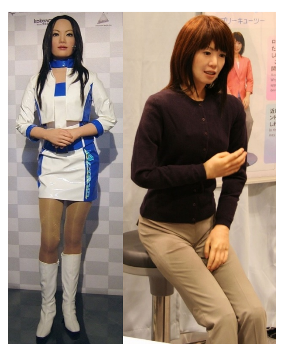
Figure 4: Actroid Repliee Q1 (left) and Q2 (right) (Robotics Today). 121