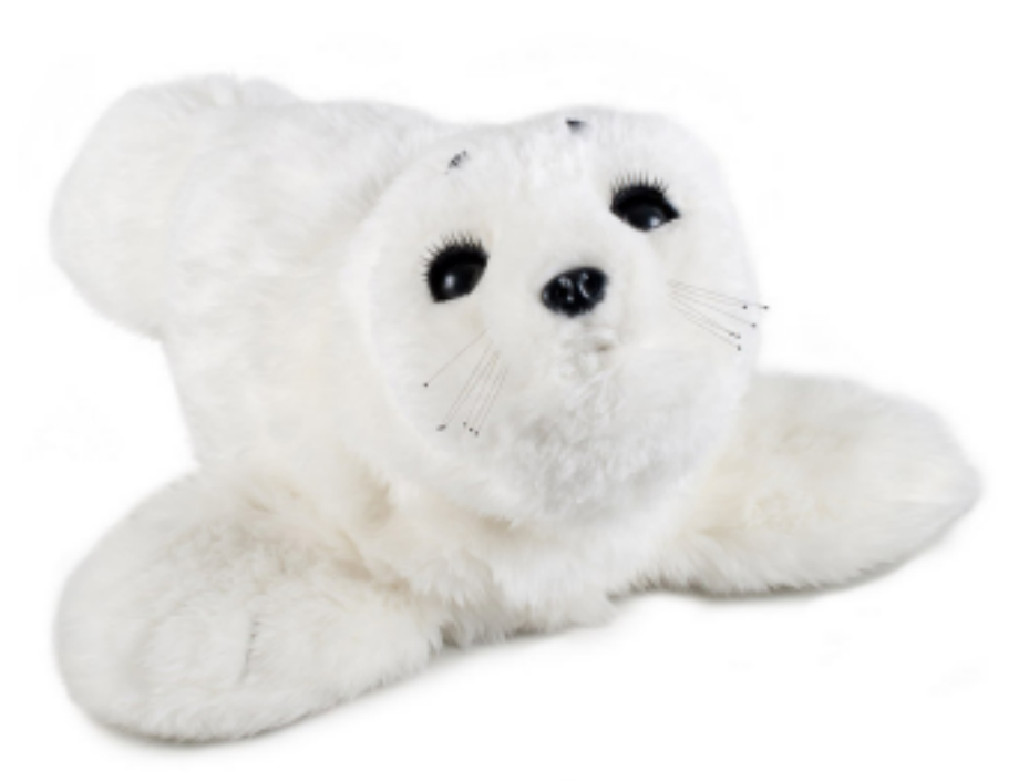
Figure 1: Paro, robotic baby harp seal (IEEE Robots). 114

anthropomorphisation and genderisation prevalent elsewhere. Given that most people don't have personal interactions with seals to draw on, they have few expectations of its robotic counterpart apart from those functions promised by marketing materials.