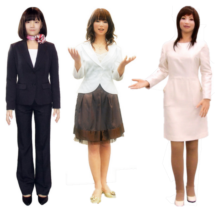
Figure 5: Actroid-DER series (left to right) DER1, DER2, DER3 (Kokoro). 122