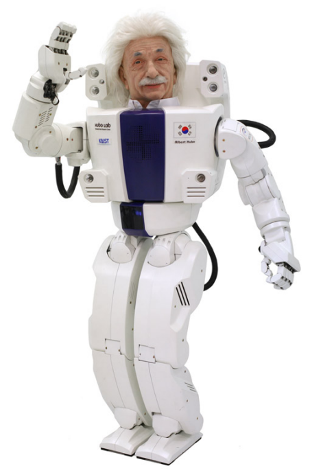
Figure 7: Albert HUBO. 124

Einstein's theory of relativity (Robertson 2018, 21). Albert HUBO was a robotics breakthrough combining the bipedalism of humanoid robotics with the photorealism and facial movements of androids and gynoids (Robertson 2018, 21).