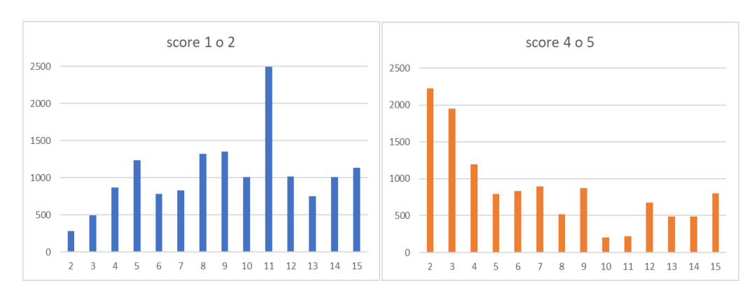
Figure 2. Score distributions in the RT section, with negative scores in blue and positive scores in orange.

In accordance with the generality of RQ 1, in this work, we did not enter the details of this section. We computed the frequency distribution of the score with respect to the 14 questions, and we focused on some results. In the following graphs (Figure 2), the score distributions referring to remote teaching are reported and are grouped into negative and positive scores.