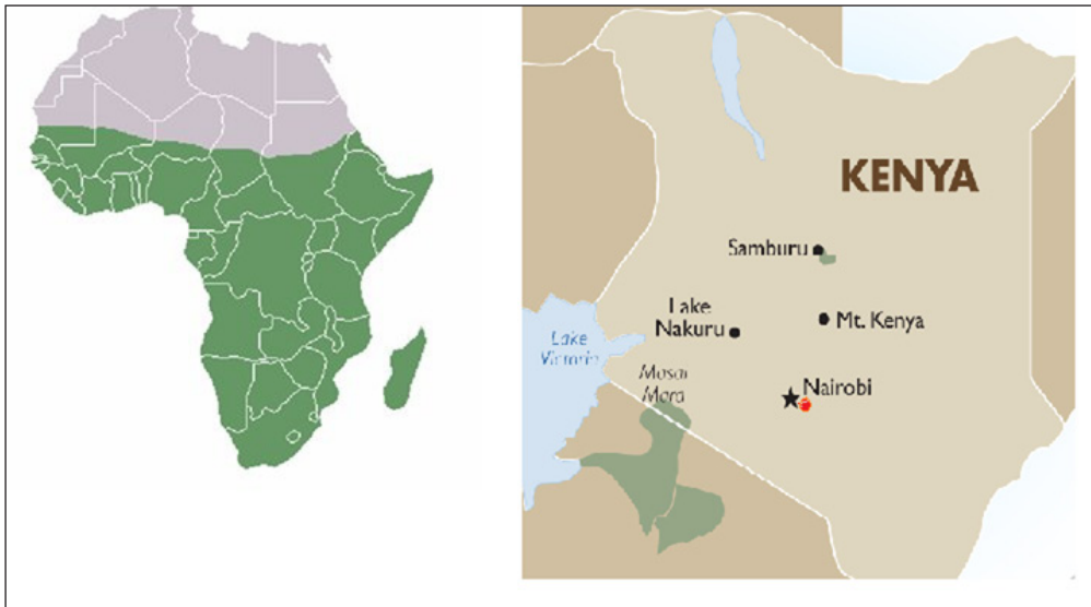
Figure 1 Map of Sub-Sahara Africa and Kenya.

Map of Sub-Sahara Africa and Kenya. The Aga Khan University Hospital is a private 300 bed referral Centre located in Nairobi, Kenya's capital city, receiving patients from the Aga Khan outreach clinics in East Africa and other hospital both private and public in the East African community, a conglomerate of 10 countries. It is equipped with various modalities of cardiac imaging; an echocardiography lab, CT coronary angiography, Cardiac MRI and ischemia testing. It has two operational catheterization laboratories and is accredited as a primary PCI Centre. It has a dedicated coronary care unit as well as a 5-day outpatient cardiac clinic for ambulatory patients. It serves a multiracial community.