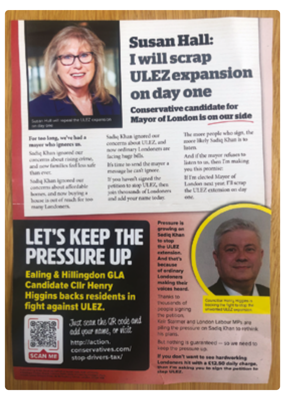
The Plan for Drivers and the campaign against the ULEZ expansion—the aim is to attract voters from the opposition who may prefer driving their cars relative to a range of environmental interventions that are aimed at reducing car travel

However, the same strategies are being followed, with Susan Hall actually a well practised populist candidate, with a history of pursuing wedge politics.