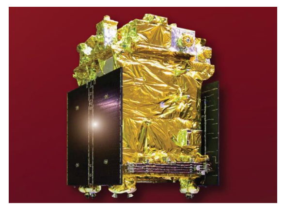
Figure-2 Stowed View of Aditya-L1 Spacecraft