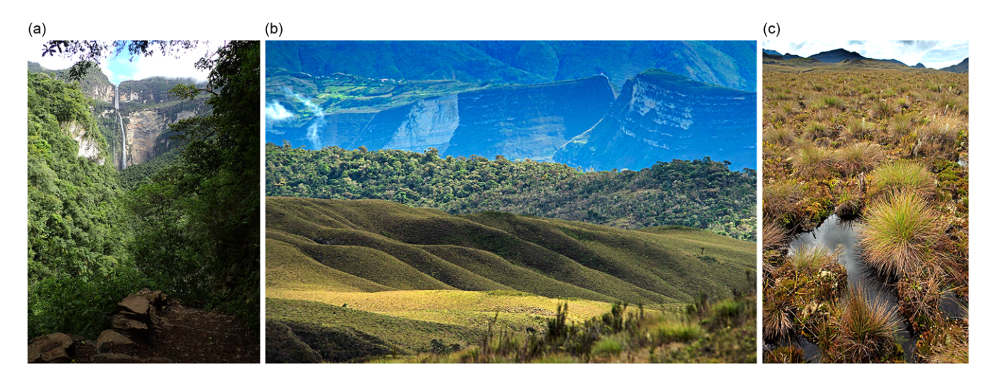
Figure 2. Images of the study area. (a) Gocta waterfall surrounded by montane cloud forests (photo by GF Curatola Fernández). (b) Landscape of the drainage area of the Gocta waterfall composed of jalca vegetation and montane cloud forests (photo by WH Wust). (c) Peatlands in the Gocta waterfall drainage area (photo by WH Wust).

highland area. These threats have also been identified in more extensive studies of Andean grasslands (Buytaert et al. 2006, Ochoa-Tocachi et al. 2016).