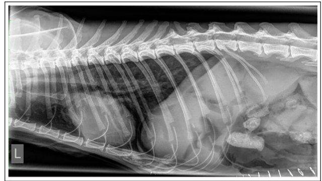
Figure 2 Postoperative left lateral thoracic radiograph. No esophageal distension is visible; the gas-filled structure in the caudodorsal thorax is no longer visible. Note free gas in the peritoneal space secondary to surgery

Postoperatively, the cat was hospitalized for 10 days with the gastrotomy tube in place. However, during this time the tube was not used, as the cat started eating well, with no further vomiting.