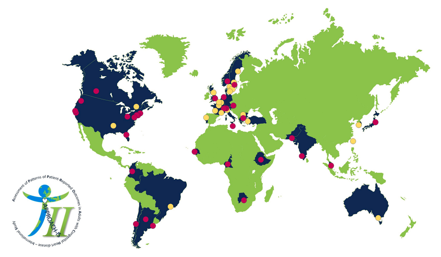
Fig. 2. Geographic distribution of the APPROACH-IS II participating centers. Yellow dots indicate centers that are participating in Part 1 and Part 2 of the study (n = 21). Pink dots indicate centers that are participating in Part 1 only (n = 32). (For interpretation of the references to colour in this figure legend, the reader is referred to the web version of this article.)

participating centers have a local principal investigator, responsible for the study execution in their center.