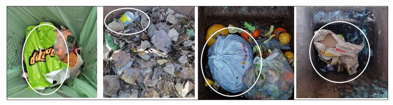
Figure 3 Examples of other types of waste placed in the organic waste bins (Source: author's own, 2022).

Table 2 summarizes the more visible meanings and materials around household organic waste, which are either enables or deterrents for the overall waste sorting practice.