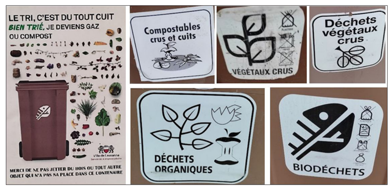
Figure 4 Different labels present on municipal organic waste containers.

So yes, it says that it's for biomethanation, agriculture and then electricity and biogas too ... but in fact, we don't know concretely how it happens, we've never seen ... it's a bit of a black box. People aren't sufficiently aware of what they should and shouldn't put in and why it's important. Maybe if they could see it through