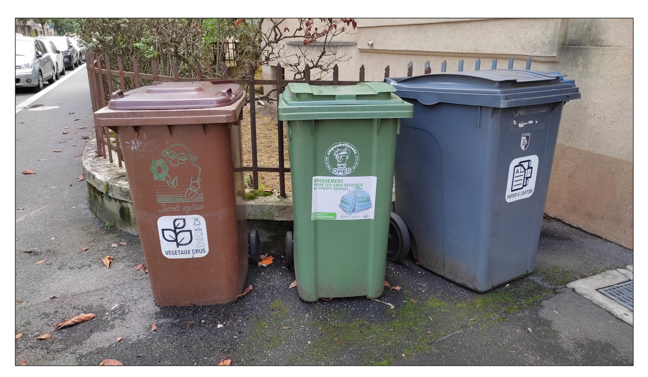
Figure 2 Waste bins available next to an apartment building, showing (from left to right): organic waste (here labelled végétaux crus or raw vegetables); general waste; and paper and cardboard.

Previous literature has found a definite relationship between reduced distance travelled to a recycling site and shifts towards recycling (e.g., Barr et al. 2001; Sidique et al. 2010). It was also found that implementing curbside collections increases recycling rates (Derksen & Gartrell 1993; Dijkgraaf & Gradus 2017; Koch & Domina 2002). Several interviewees spoke about the convenience of having organic waste containers near to their home which encourages them to separate out organic waste and ascertain opportunities for composting. Most of