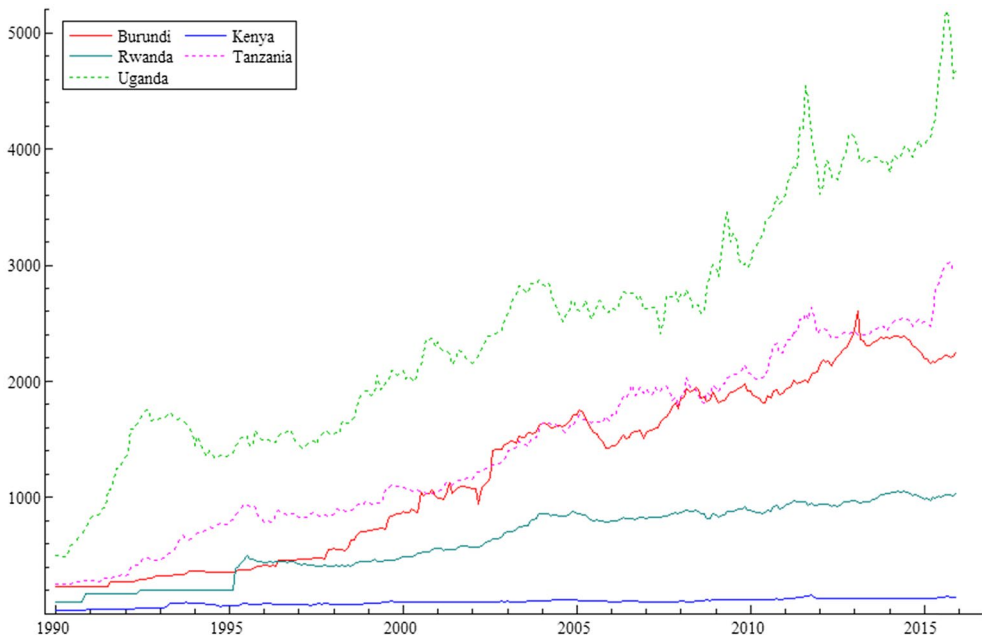
Figure 1. Real exchange rates of the member countries of the EAC [Colour figure can be viewed at wileyonlinelibrary.com ]

We employ monthly data on real exchange rates defined in terms of domestic currency vis-à-vis the U.S. dollar from 1990 to 2015; these were obtained from the IMF's International Financial Statistics ( https://data.imf.org/?sk=4C514D48-B6BA-49ED-8AB9-52B0C1A0179B&tsId=1409151240976 ). The year 2015 was chosen by which monetary union was initially expected to have been achieved, which makes it interesting to assess its feasibility at that stage, and also makes our results directly comparable to those of other related studies using a similar sample. The series are shown in Fig. 1, and appear to have a similar behaviour, all of them exhibiting an upward trend. Standard unit root tests suggest that none of them is characterised by I(0) stationarity (see Table 1). For the business cycle synchronisation analysis carried out subsequently, we use instead annual data on real GDP (at current purchasing paper parities in order to make meaningful