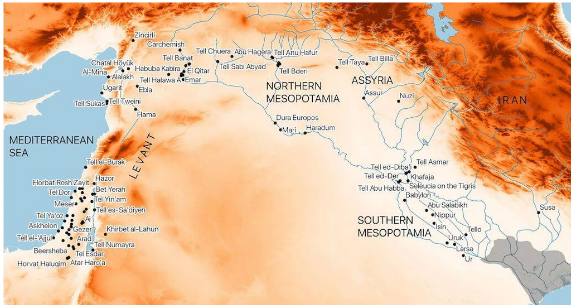
Figure 1: Sites used in our analysis that had house size data. (Image: Squitieri and Altaweel 2022)

In previous studies, wealth inequality has been analyzed through measures that capture disparity in a population. One of the most common measures is the so-called Gini coefficient , which measures statistical dispersion in data. Typically, values are between 0 and 1 in a Gini coefficient, with 1 indicating complete inequality and 0 reflecting total equality. For example, countries such as the United States have a Gini coefficient of nearly 0.5 in measures for income, indicating a relatively high disparity, in contrast to countries such as Denmark, which is closer to 0.28. There are other inequality measures, such as the Atkinson index , which have been argued to be sometimes better at capturing certain aspects of data distribution and inequality, but these work similarly to the Gini coefficient. We used Gini and Atkinson together to measure disparity in house sizes from published data across the Near East.