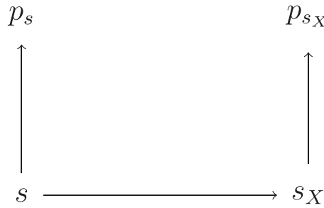
FIGURE 2 Credal states, conditionalization, and induced probabilities

that the way these probabilities change upon conditionalization can be reliably estimated by the ratio formula. 31